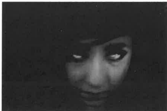
Eden Menta Not titled 2015 Inkjet print on ChromaJet metallic pearl 21 x 30cm