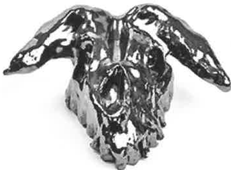
Bronwyn Hack Sheep skull 2014