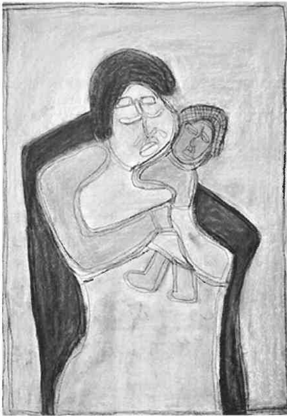
Valerio Ciccone Not titled 2015 pastel and pencil on paper 70 x 50cm

Arts Project Australia artists continue to garner national and international success in prizes, awards and inclusion in contemporary exhibitions. Some recent artist accomplishments are outlined below.