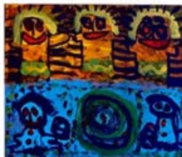
Sophie Janson "Boys as Trees" acrylic on canvas 61x52cm