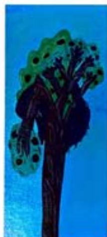
Kimberly Sellars "Pine Tree" acrylic on canvas 31x41cm