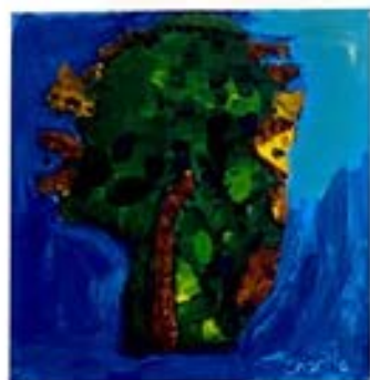
Charlie Taplin "Big Tree" acrylic on canvas 61x61cm