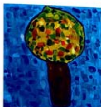
Aimee Crathern "Mosaic Tree" acrylic on canvas 61x61cm