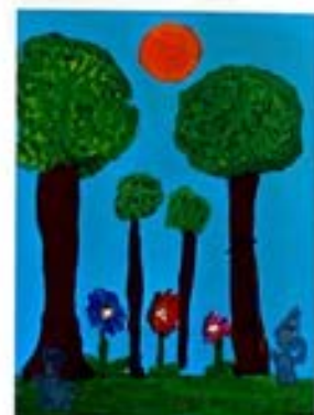
Tracey Pagett "Sunny Day" acrylic on canvas 31x41cm