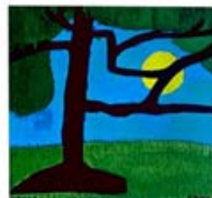
Trisha Ferguson "Tree of Dreams" acrylic on canvas 61x61cm