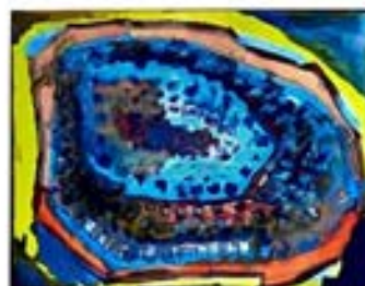
Tim Cannell "Pool" acrylic on canvas 46x36cm