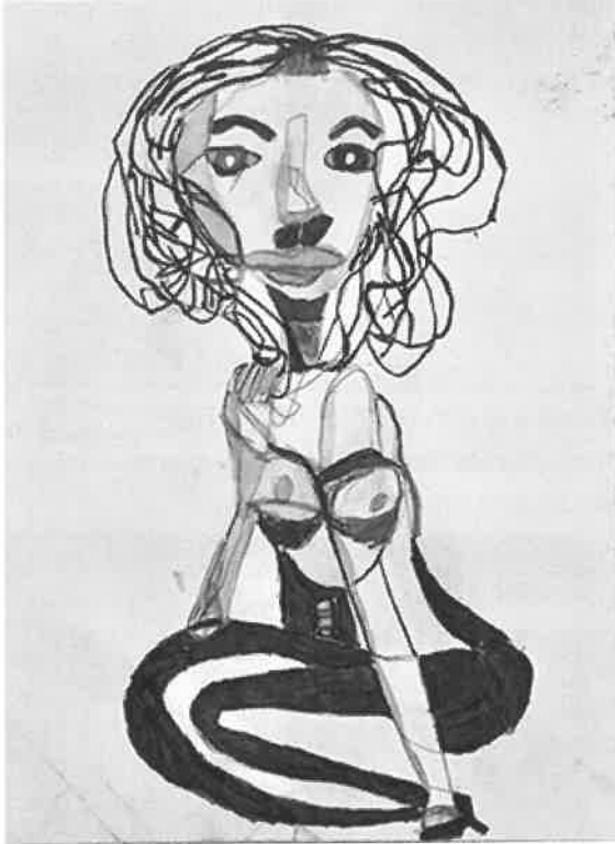
Cam Noble Ghost whisper at nighttime 2015 work on paper 38 x 28cm

Cam Noble's first solo exhibition presents a figurative collection of recent works on paper.