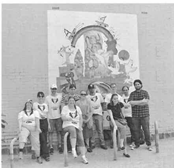
Past and present members of the Northcote Penguins in front of their mural at the Chalice Uniting Church

The Arts Project Australia Professional Practice Program provides a group of eight Arts Project artists the opportunity to deepen their understanding and appreciation of their own arts practice, and that of their contemporaries within the broader visual arts environment. The program that has been running since 2015 and enables group members to not only learn new skills but to build their careers as artists.