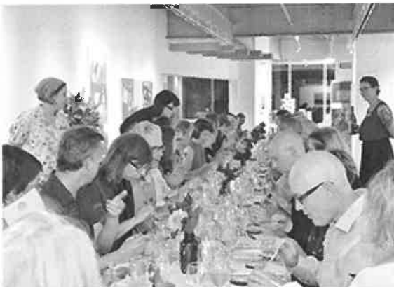
Guests at Dining with Art - Signature Style