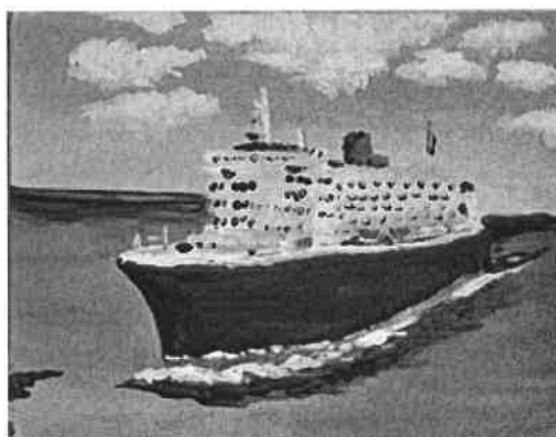
Peter Cave Not titled (ocean liner) 2010 acrylic on canvas 28 x 36cm