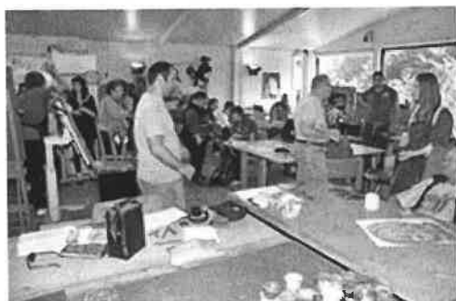
Artists, staff and volunteers in the studio