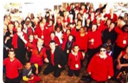
Tutti Choir at WOMADelaide March 2010

Tutti Choir returned from the summer break early February and headed straight into twice weekly rehearsals throughout March for the WOMADelaide performance. Tutti's performance on Stage 2 was a spectacular event for performers and audience alike. March also saw Poco Tutti head to Mildura in Victoria, for the Mildura and Wentworth Arts Festival for two performances and one workshop. Preparations (auditions and rehearsals) are now underway for the Tutti/Unley Concert Band collaboration Broadway Spectacular to be held in Elder Hall in early July.