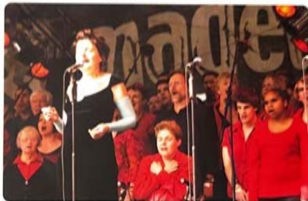
The Tutti Choir and Canadian singer-songwriter Jane Siberry at WOMADelaide 2010