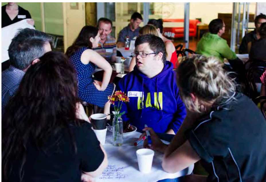
Discussions taking place at the Community Café