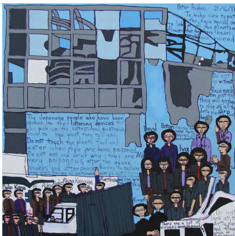
Peter Hughes, Earthquake in Japan , Acrylic on canvas, 61 x 61cm