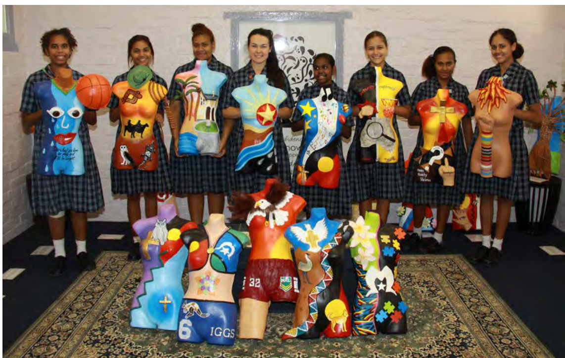
Ipswich Girls Grammar School students with their Body Language artworks