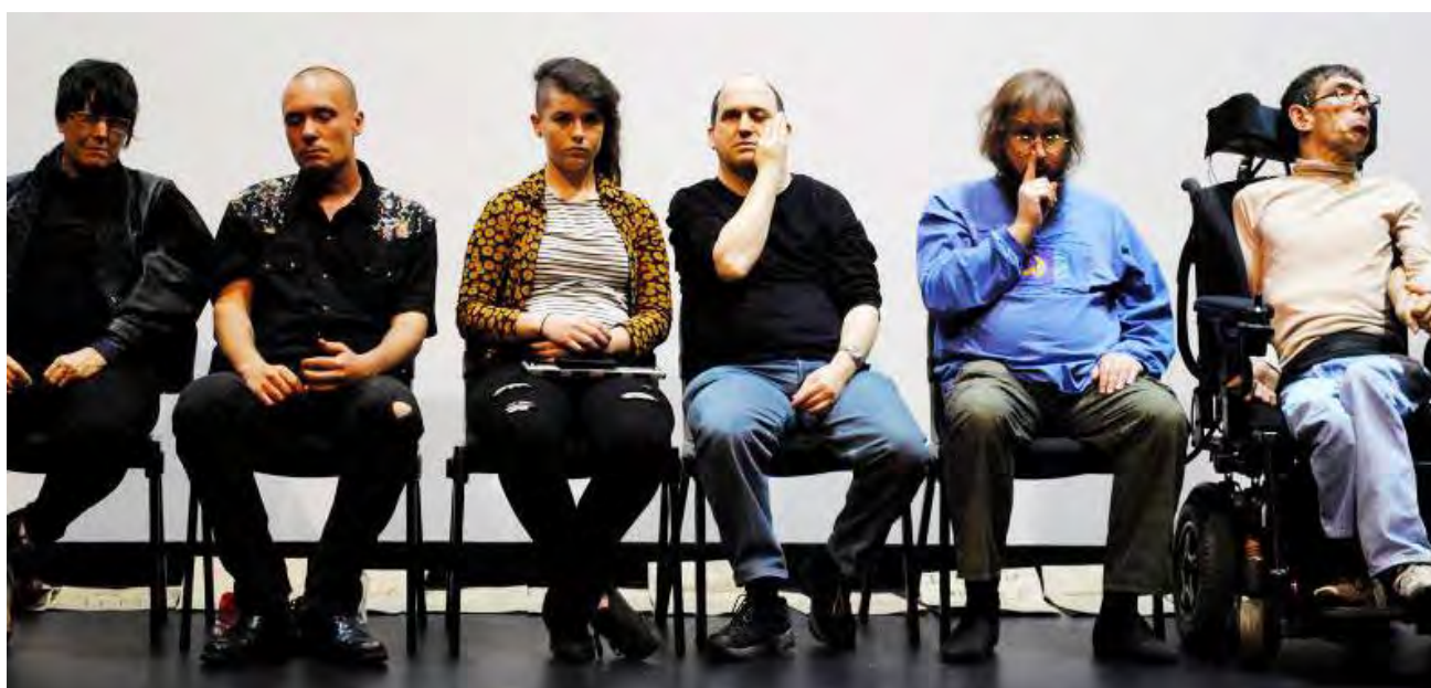
Rising Star participants – Tiny Little Lies