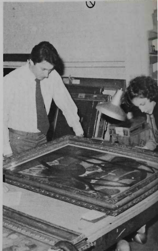
Arts Board from its inception as a means of assisting artists and promoting Australian art abroad.

The Public Art Program drew an increased number of commissions for artists from government and private bodies. A potentially significant increase in artists' commissions came with the decision by the Overseas Property Bureau and the Treasury to allocate for the commissioning of works of art a percentage of the cost of building each Australian chancery overseas. This development had been sought by the Visual