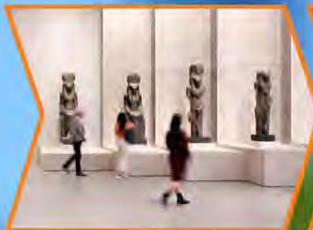
PHARAOH NGV International