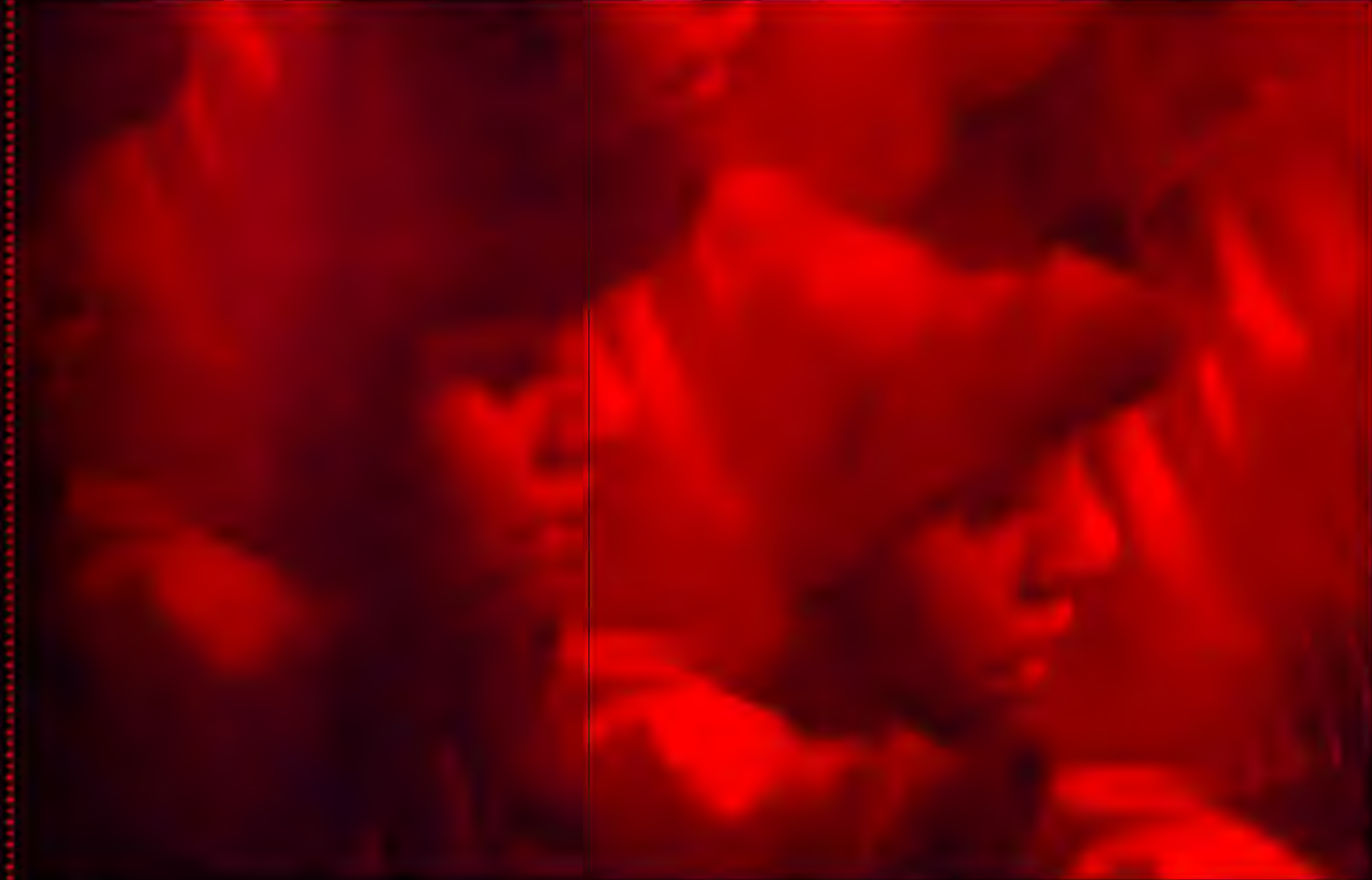
Cover Image: Threshold by Sofya Gollan.