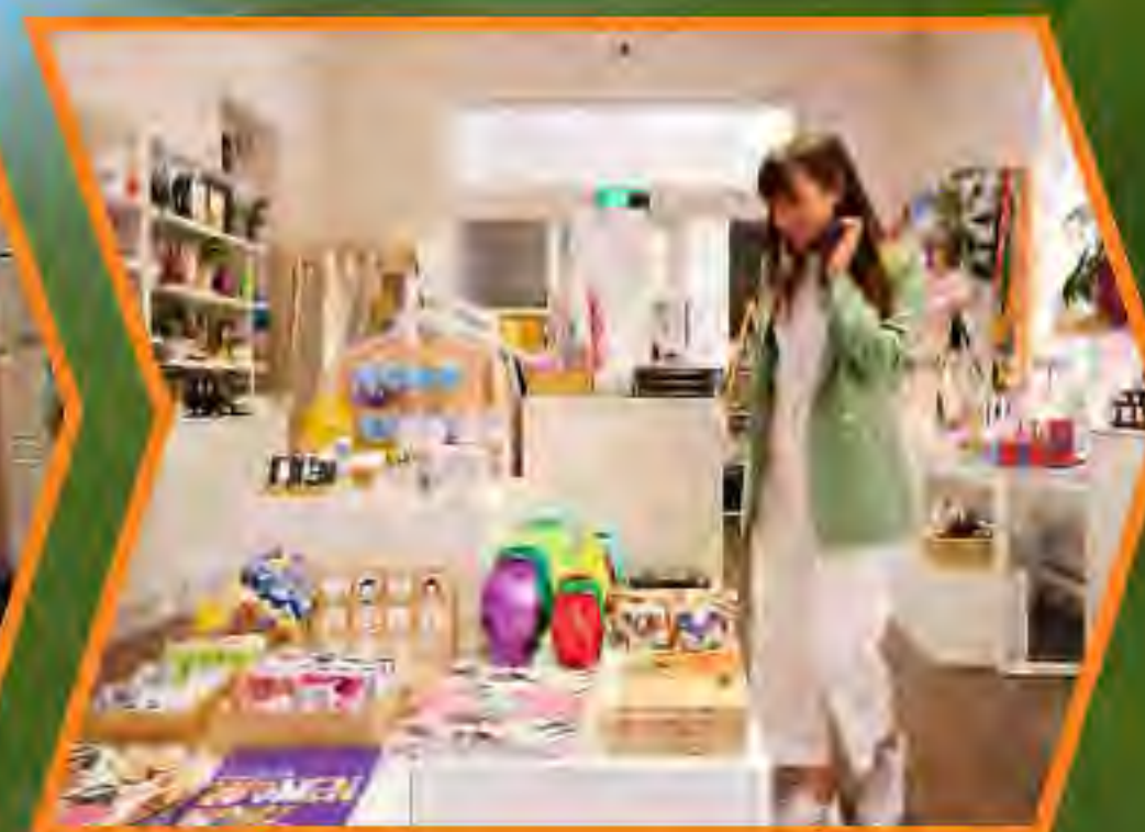
QV WOMEN'S CENTRE SHOP Lonsdale St