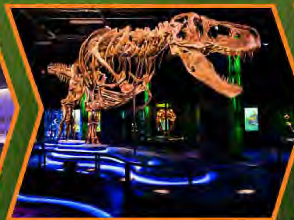
VICTORIA THE T.REX Melbourne Museum