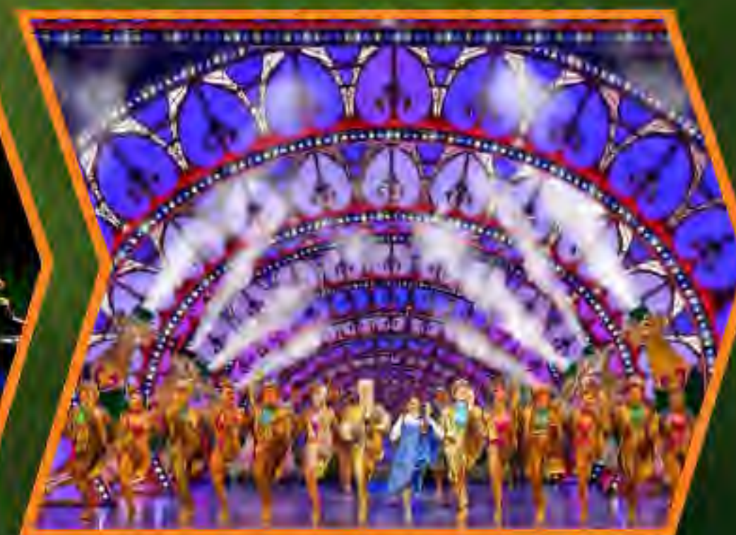
DISNEY'S BEAUTY AND THE BEAST Her Majesty's Theatre