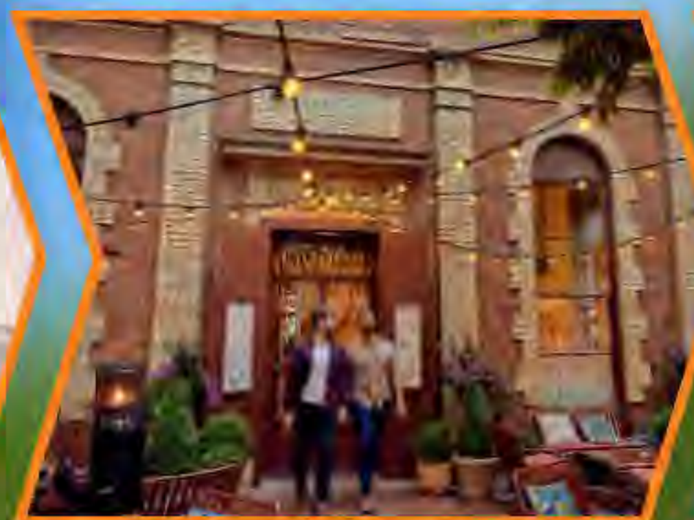
PEPE'S ITALIAN & LIQUOR Exhibition St