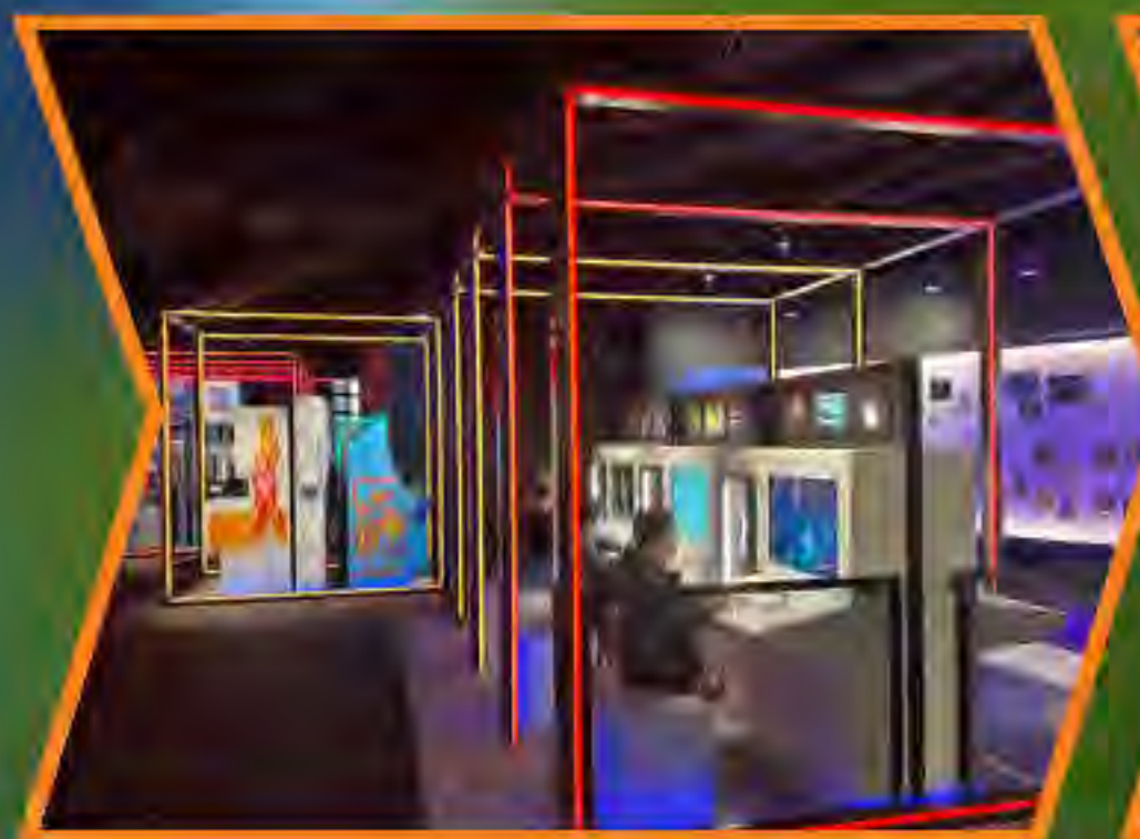
ACMI Flinders St