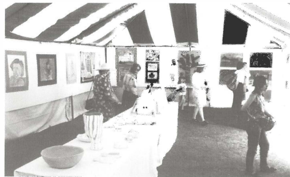
Left: The SRS Mixed Media Exhibition reached a large audience in the Blessington Gardens, St Kilda bringing the work of artists with disabilities to attention of a wider community.