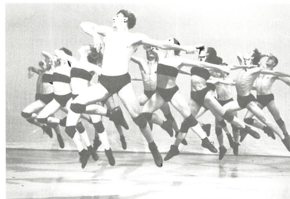
Kibbutz Contemporary Dance Company, in 'Read My Hips' at MIFA.

There are only two fully sign-interpreted performances scheduled for Blabbermouth . Details are listed elsewhere in this newsletter and in the EASE Ticket Update . EASE Bookings 699 8497.