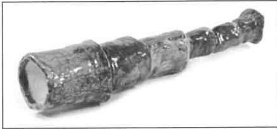
Matthew Gove Not titled 2012 ceramic 9 x 38 x 8cm