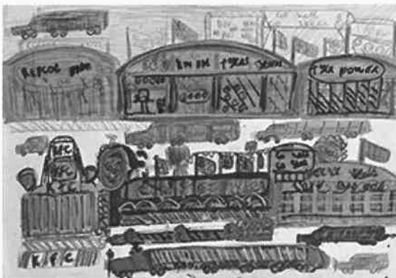
Steven Perrette Not titled 2011, acrylic, glitter, marker and pencil on paper 50 x 70 cm