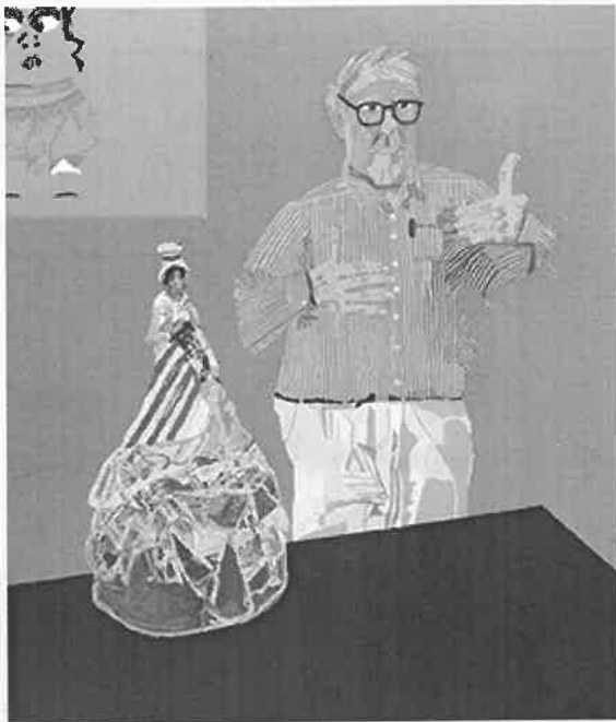
Lisa Reid Peter Fay 2007 acrylic on canvas 177 x 151.5 cm

Presented in two chapters across ACCA's four exhibition galleries, Painting. More Painting is a big-picture focus on contemporary Australian painting, featuring the work of over 70 living Australian artists.