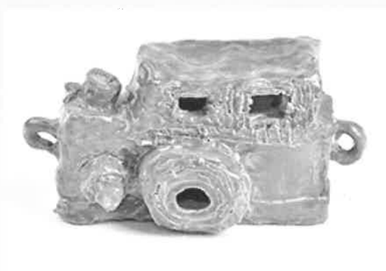
Alan Constable, Not titled 2016, glazed earthenware 13.5 x 25 x 9.5 cm