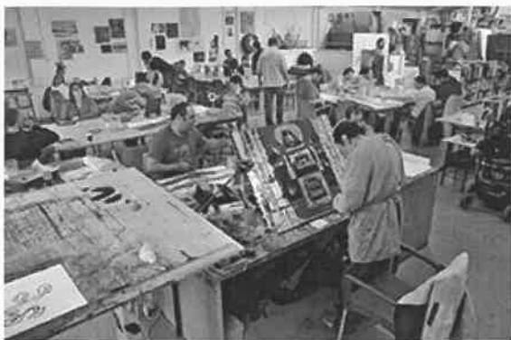
The Arts Project Australia studio

This grant will ensure that artists continue to be provided with high quality materials, that specialists are engaged to deliver workshops in specific artistic techniques, and assist in delivery of field trips to external exhibitions, artists' studios and special events. In addition, it will assist in mentoring selected artists to learn how to curate an exhibition of their own work.