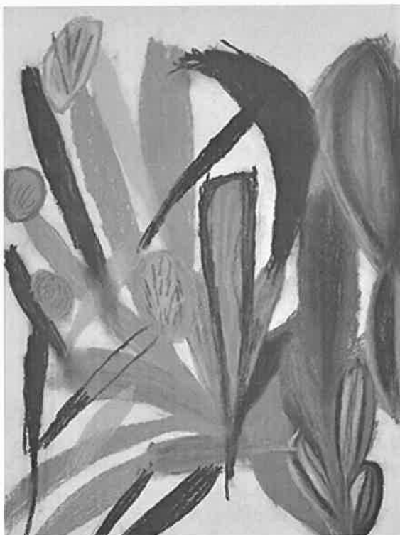
Georgia Szmerling, Wattle branch 2015 pastel on paper, 76 x 56 cm