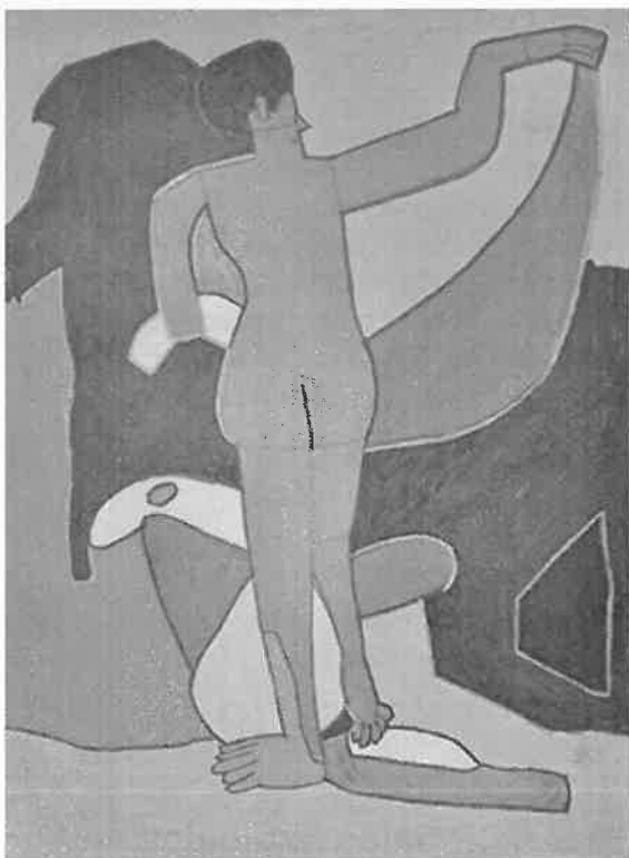
Anthony Romagnano, Nude 2016 pencil on paper 38 x 28 cm