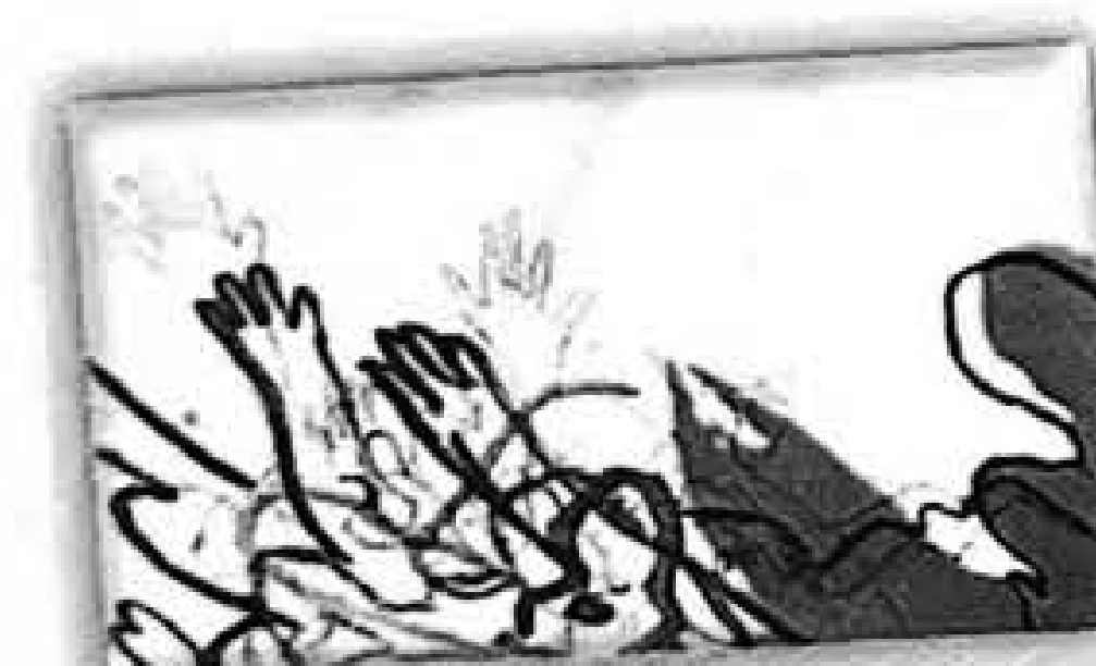
shadow animation drawing