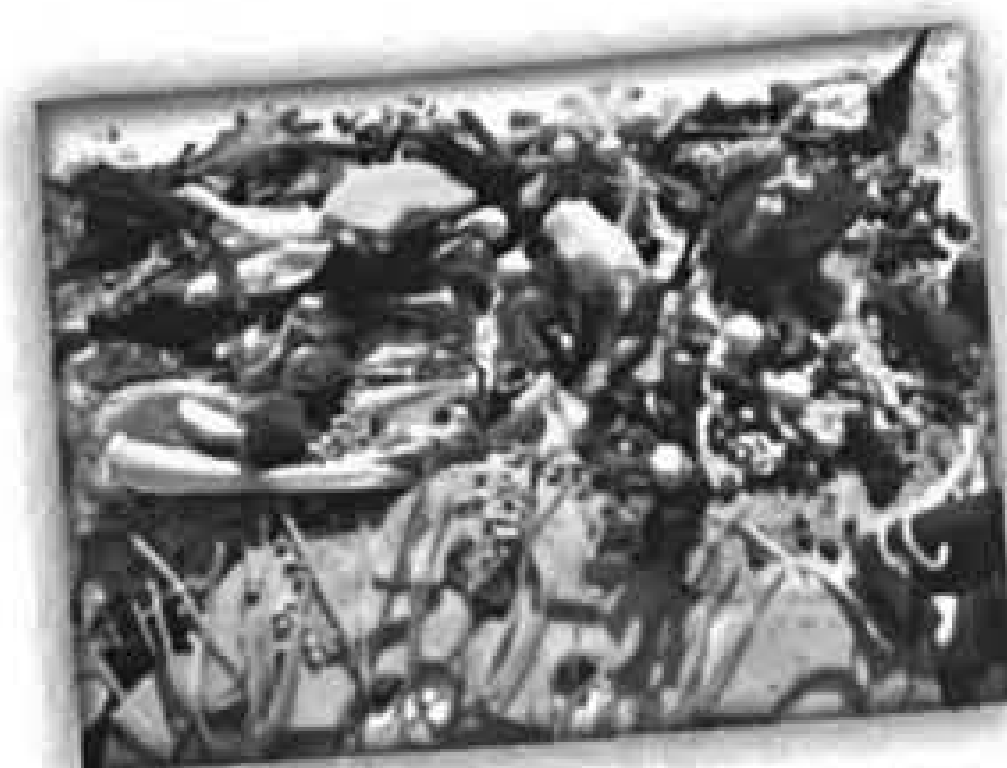
food animation project

Arts Access Victoria runs dynamic and diverse visual and performing arts projects, providing people with disability an opportunity to create, celebrate and experience the arts.