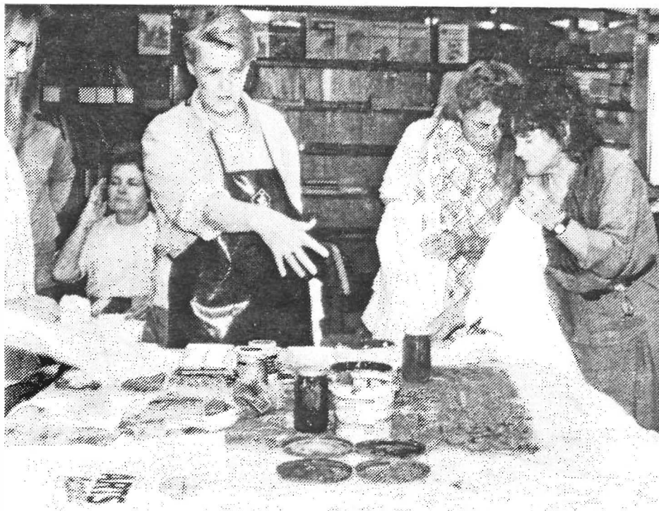
Staff Inservice Day at Arts Access.

The programmes that Very Special Arts are involved with are many and varied. During the trip they were responsible for visits to Theatre Unlimited, a theatre specifically for intellectually disabled people,