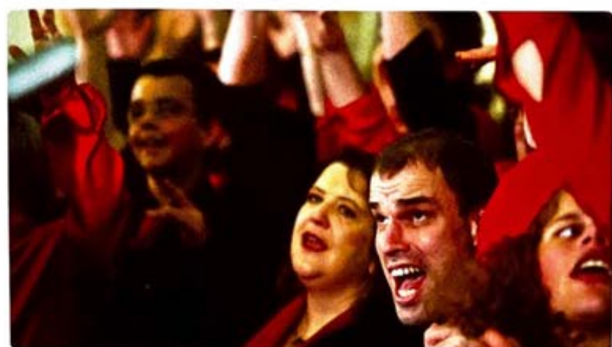
Let It Shine concert at Christ Church, North Adelaide