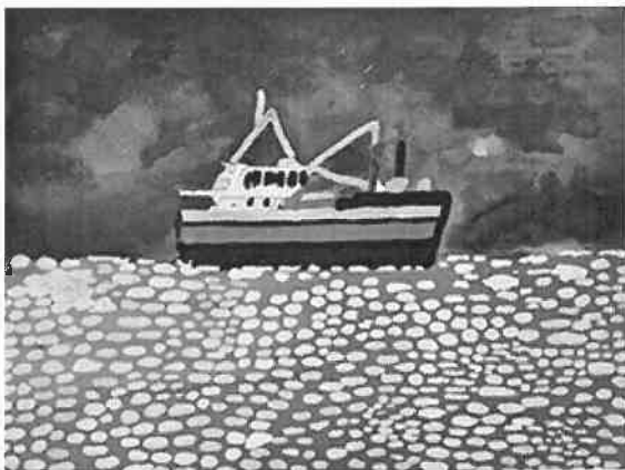
Peter Ben, Not titled 2014, gouache on paper 28.5 x 38cm