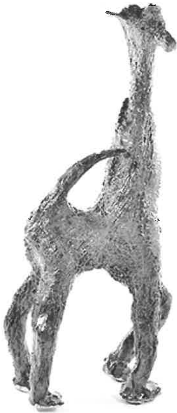
Georgia Szmerling Giraffe 2015 ceramic 36 x 16 x 8.5cm