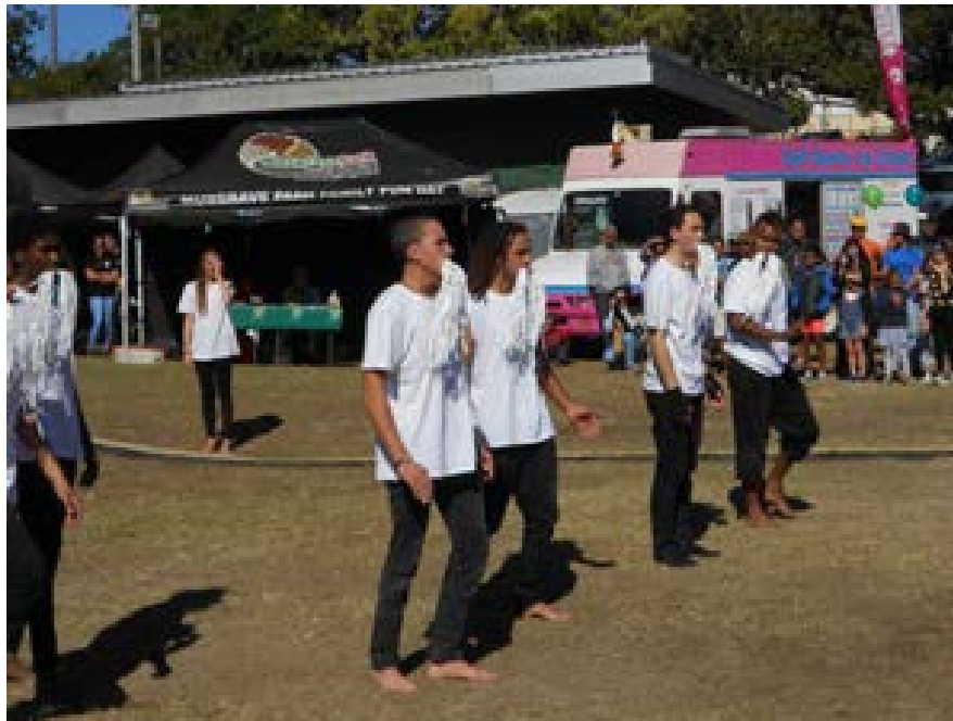
NAIDOC July 2014

We worked with Inala Wangarra on a Rite of Passage Ball for young school leavers. Celebrating NAIDOC was a partnership with the Aboriginal Centre for Performing Arts.