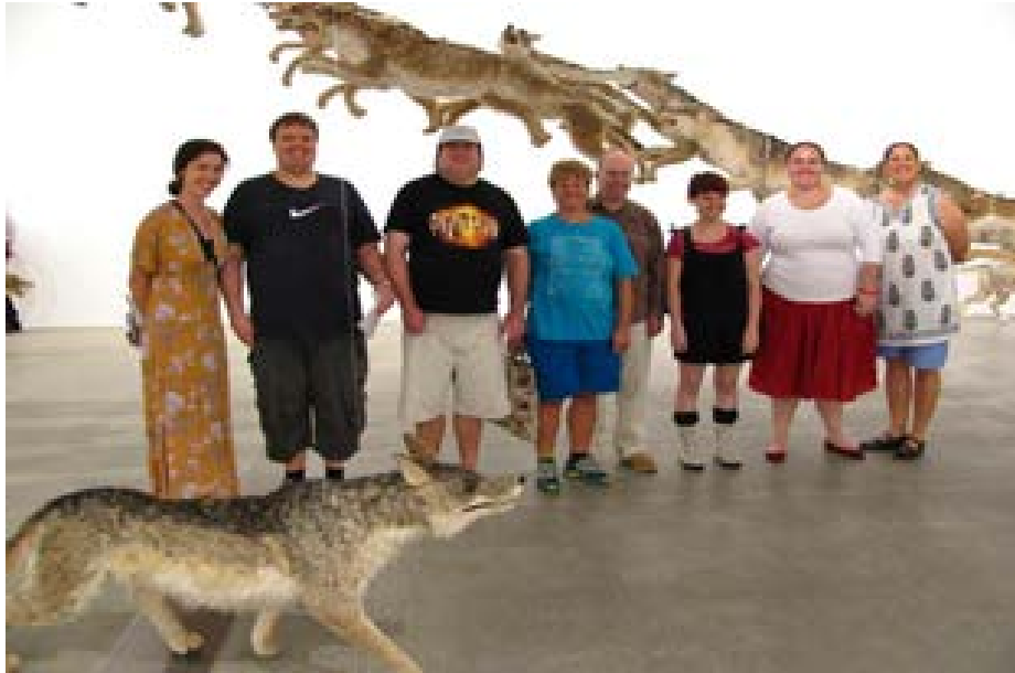
Members of Brisbane Outsider Artists' Studio on a gallery visit to Falling Back to Earth by Cai Guo-Qiang at GOMA