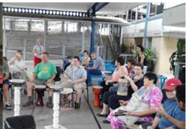
Drumming Workshop, June 2014