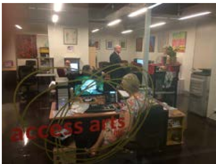
Commonwealth Attorney-General and Minister for the Arts, Senator the Hon George Brandis QC visiting the Access Arts office

Access Arts undertook an Access Appraisal of the 2014 Brisbane Writers Festival last September. In response to our appraisal report they wrote to us: 'Thank you very much to your team for putting together such a comprehensive report for us. I know I speak for all here when I say that we have gained many helpful insights from your appraisal and are looking forward to developing our policies and procedures further'.