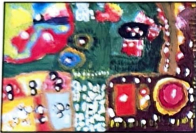
Colours 61cm x 46cm $185