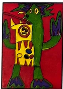
Terror Toad 61cm x 46cm $185