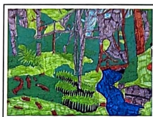
Aldgate 29cm x 21cm $85