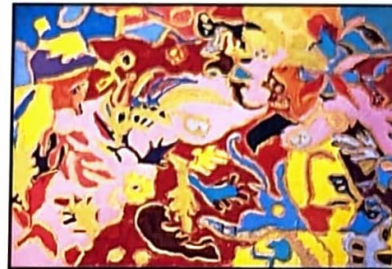
Batik 91cm x 61cm $240