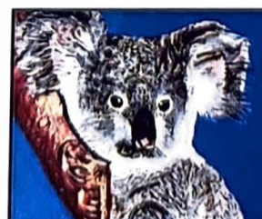
Koala 50cm x 40cm $175