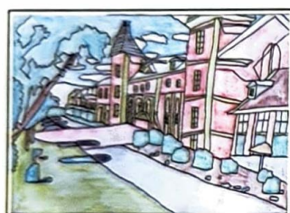
Nuriootpa 29cm x 21cm $85