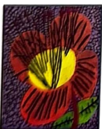
Nightflower 61cm x 46cm $185