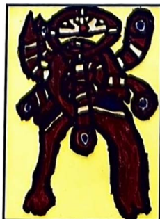
Pipe Brain Monster 61cm x 46cm $185