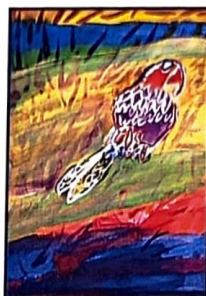
Macaw 40cm x 30cm $95