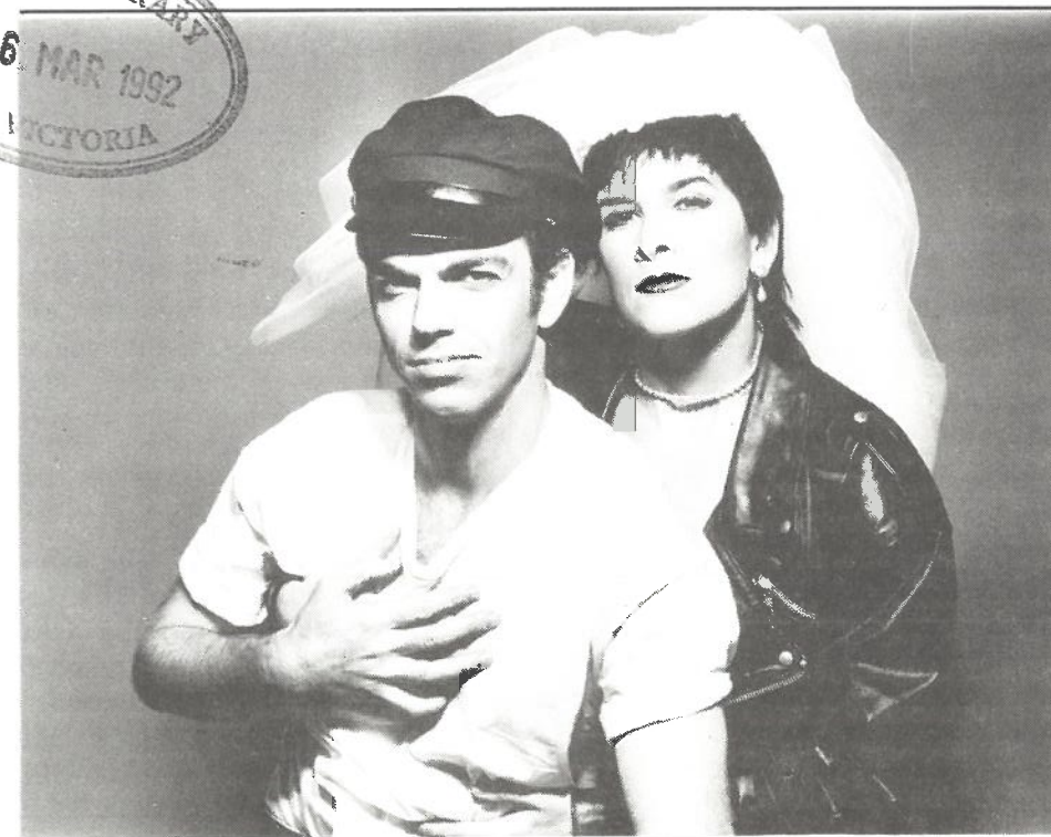
THE MTC'S production of Shakespeare's The Taming of The Shrew stars Hugo Weaving as Petruchio and Pamela Rabe as Kate. This is one of the forthcoming productions low vision theatre patrons will be able to hear Audio Described at the Playhouse Theatre.

"At the moment visually impaired people only absorb about 50 per cent of the content of a play. They get embarrassed when told not to whisper during the performance so many of them don't bother going. Audio Description will bring all those people back."