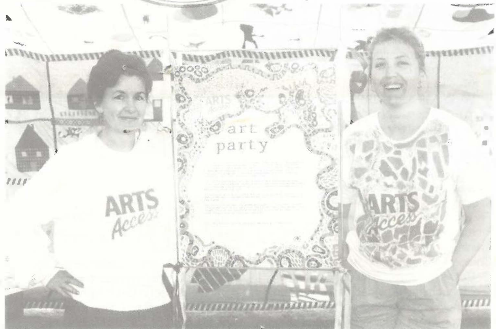
Some of the artists who took part in the best Art Party for 200 years.

Often repeated comments were "how creative children are" and "I wish I'd had