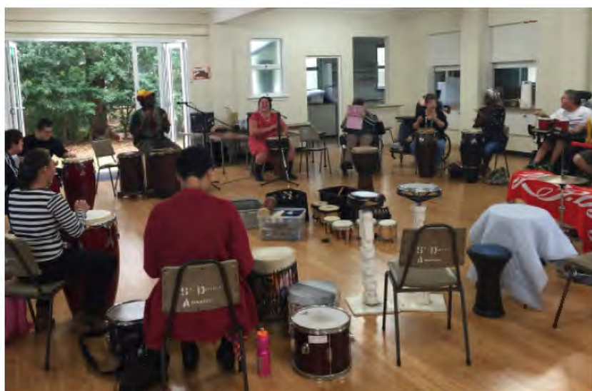
The drumming circle