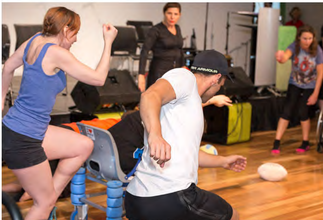
Participants in the Art Meets Sport dance workshops