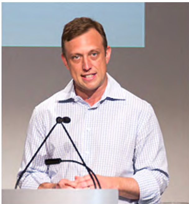
The Hon Dr Steven Miles MP