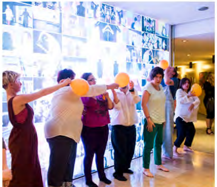
Kaleidoscopic Light Box at KPMG (with Theatre Ensemble)