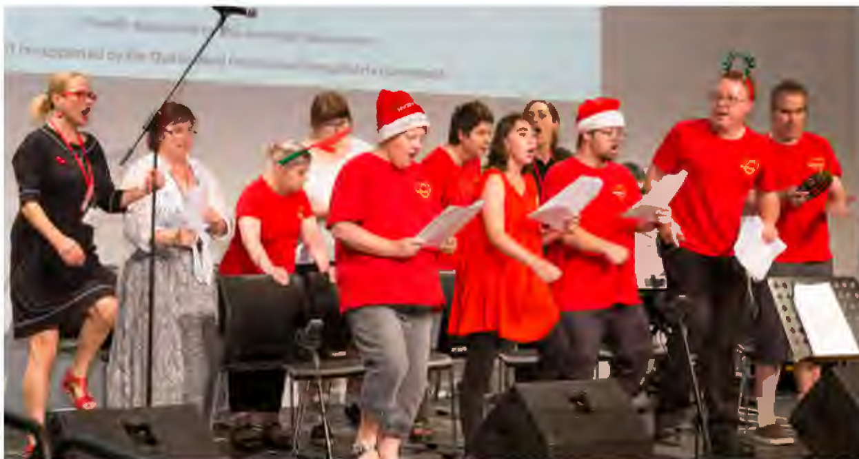
Access Arts Singers performing at Be Inspired