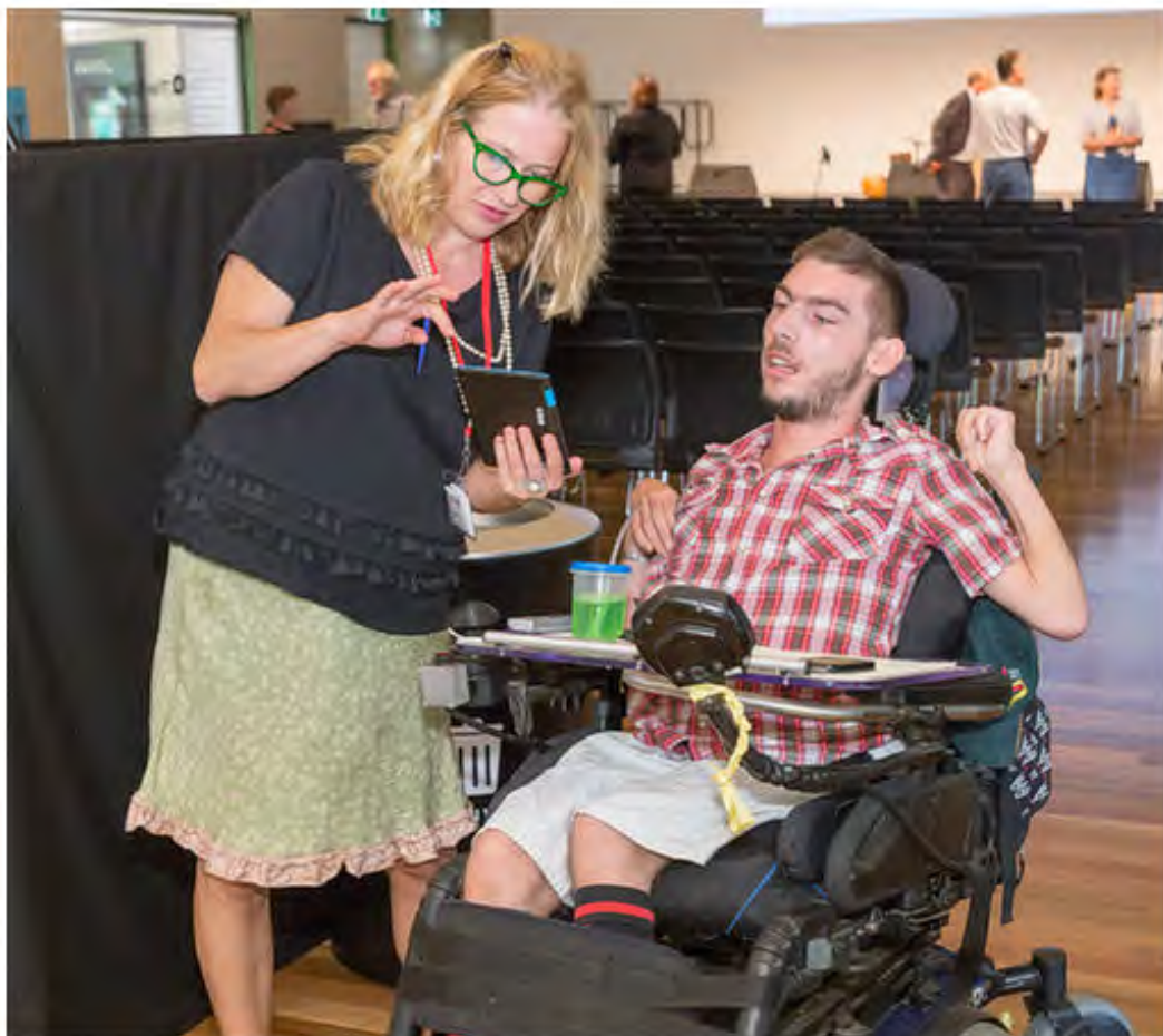
A member gives feedback through Culture Counts

To encourage an inclusive and accessible Queensland and support people with disability to enjoy mainstream services we worked with Scenic Rim Regional Council, Dancenorth, State Library of Queensland, Brisbane City