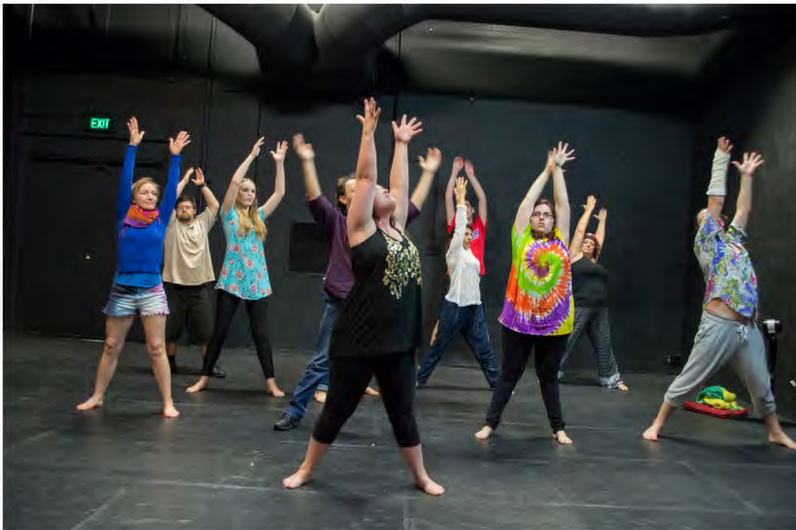
What Do You See? - Theatre Ensemble performing at the Anywhere Festival

In 2016 our Ensemble also appeared at KPMG and State Library of Queensland showcasing Brisbane as an inclusive and accessible city, and won the much coveted Metro Arts residency for 2017.