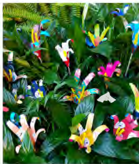
Be Inspired (to grow): detail

Be Inspired (to grow) also featured iconic Queensland flora (banana and monstera leaves) along with imaginative digital wall papers created by Access Arts member Alexandra Jack in collaboration with Access Arts and The Edge.