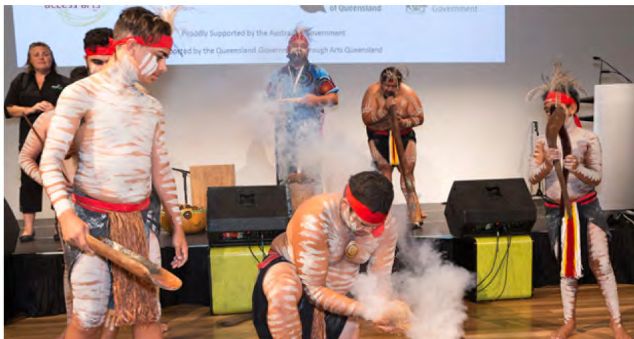
Nunukul Yuggera Aboriginal Dancers Welcome to Country at Inspirational – Art Meets Sport