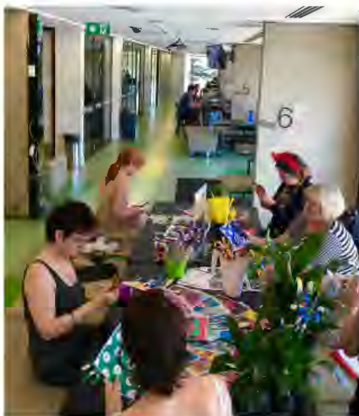
Be Inspired (to grow): Creating the window

A colourful installation Be Inspired (to grow) formed a visual centrepiece for Access Arts' celebrations. It started as a string of visual arts workshops held at the Edge in the run-up to these events. Members of the public were invited to make lily flowers adorned with artworks created by Access Arts' visual artists. These flowers were then planted alongside live lilies to form a spectacular visual blanket of psychedelic colour.