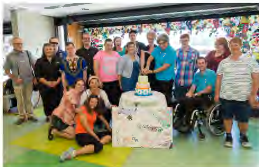
Celebrating the end of 2016 at Inspirational: Art Meets Sport , a partnership with Life Without Barriers and State Library of Queensland marking International Day of People with Disability.