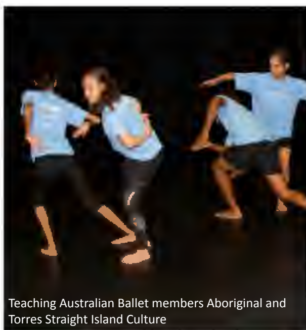
Teaching Australian Ballet members Aboriginal and Torres Straight Island Culture

We partnered with Biddigal Performing Arts on an immersive program of workshops for young people, primarily in dance but also including a range of other artforms. Experiences included Yidinji cultural dancing and West Papuan urban dancing. At different stages the young people engaged with elders from Giddimay, Yidinji and West Papua as well as professional artists, including members of Australian Ballet. The program culminated in exceptional public performances which included audio, video and special guest performances from the West Papuan community between 14 – 16 December at COCA, one of Cairns' most prestigious venues.