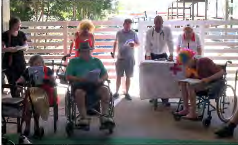
Trinder Park Residents performing The Accidental Visitor

During 2016, Access Arts delivered the creative ageing theatre program. The lively workshop program ended by showcasing very different, original pieces of theatre created by the residents.