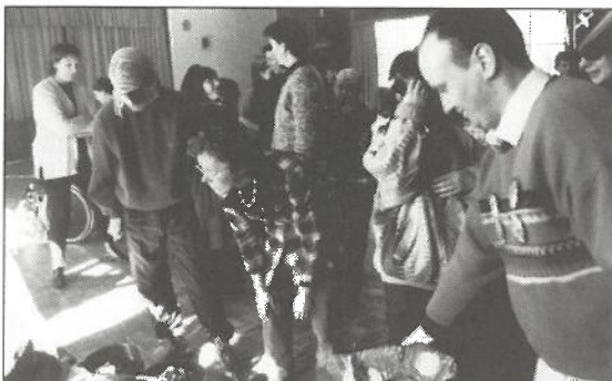
Art Day South and invited guests at Scoring Expeditions, 1997