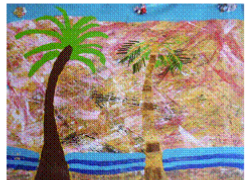
Above: Group Collage