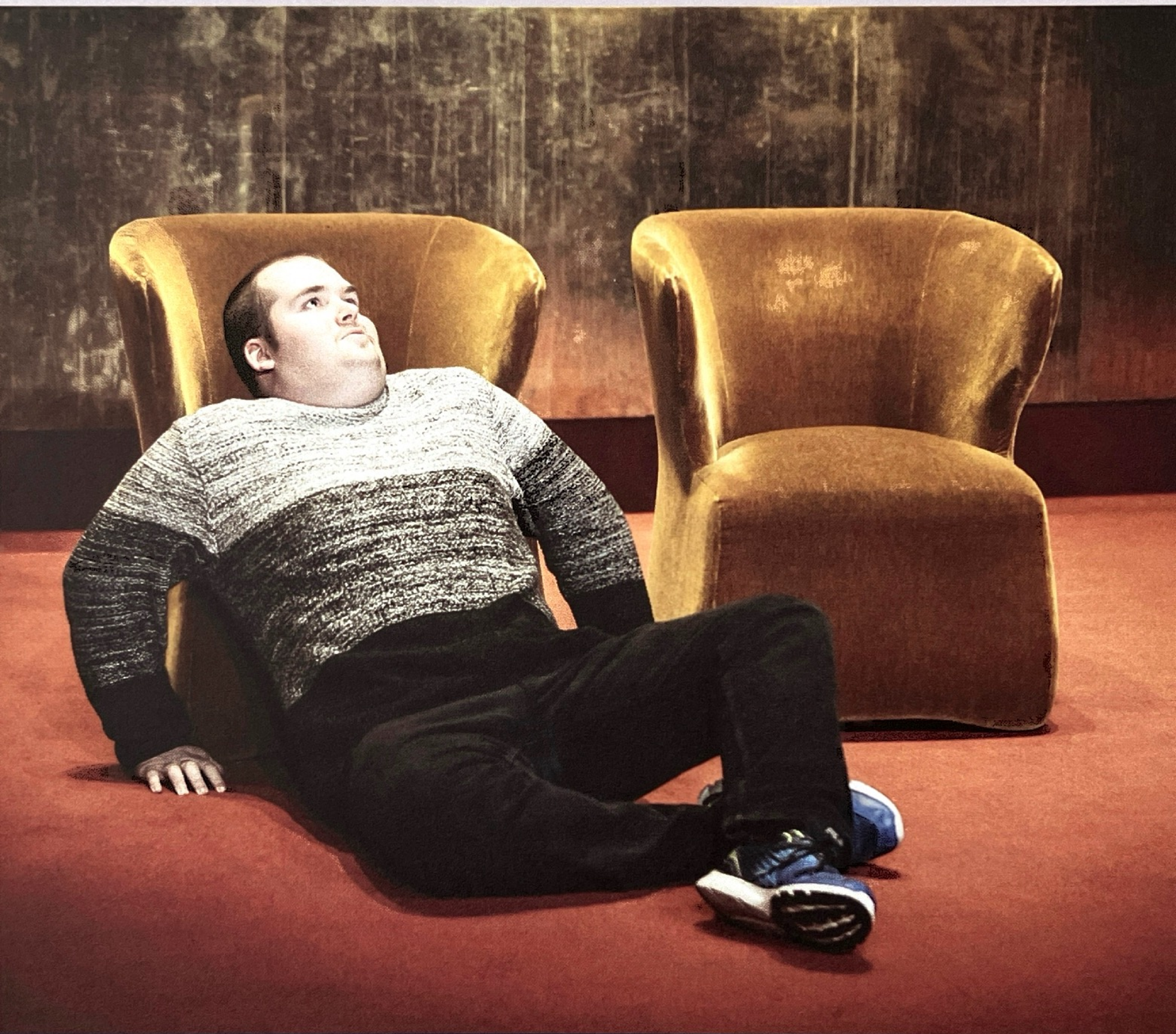
Image: Something Else , Echo Collective, The Kiln, Arts Centre, 2019.