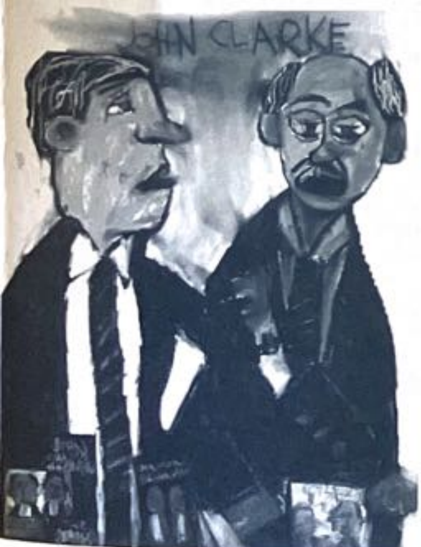
artist: Valerio Ciccone 'John Clarke and Brian Dawe' 1995 Pastel 655 x 500mm