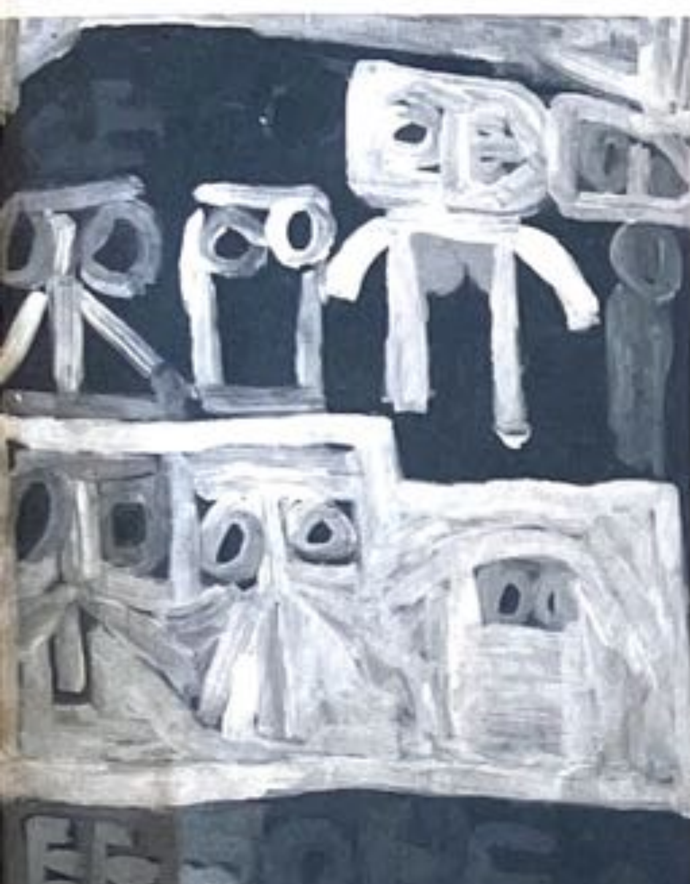
artist: Stelio Costa 'Untitled' 1993 Acrylic on paper 700 x 1000mm

Our major touring exhibition 'Drawing on Experience: Reflections on Popular Culture' was launched in June at our gallery in Northcote and will tour the eastern states of Australia over the next 2 years