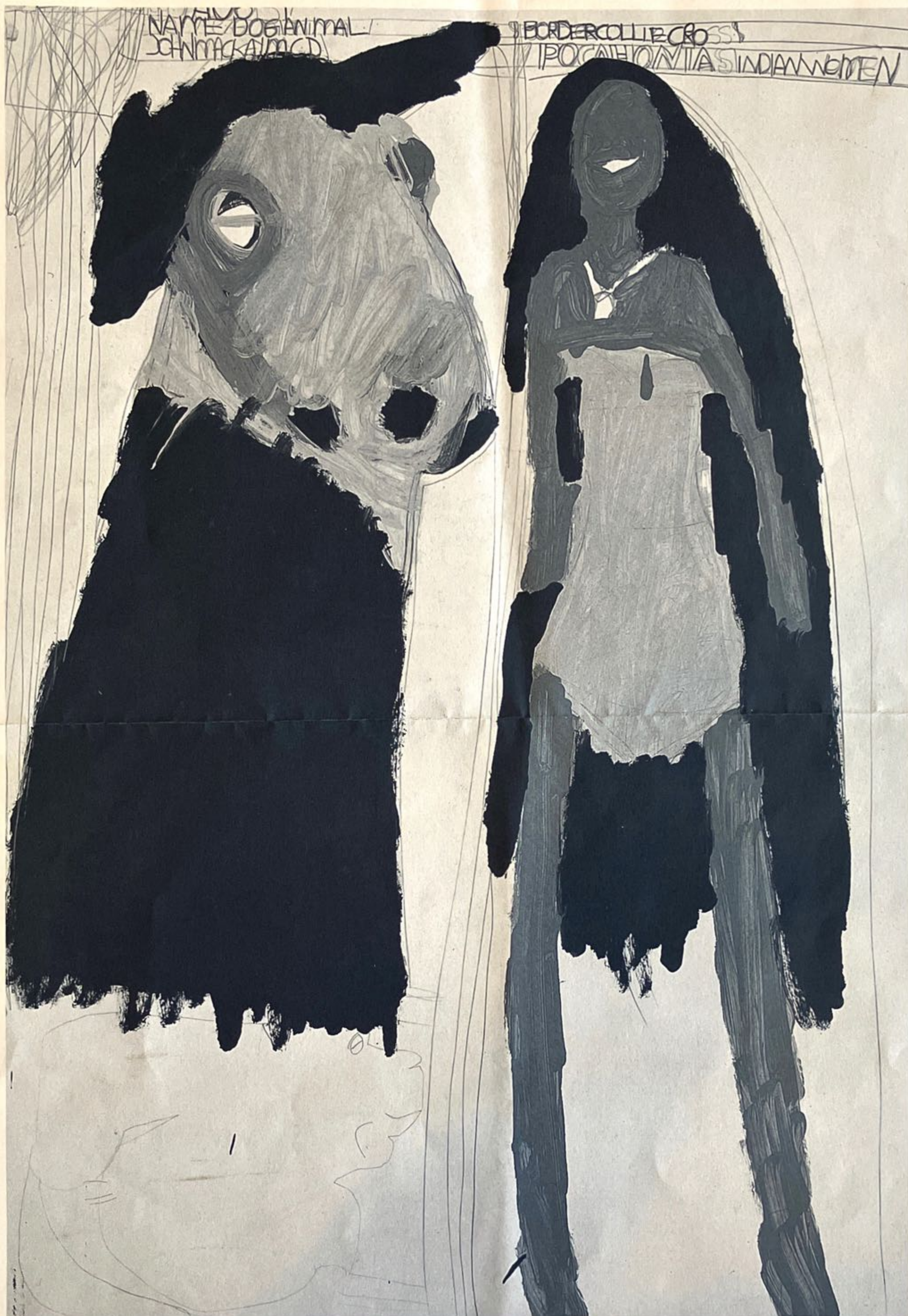
artist: John Northe 'Pocahontas' 1996 Acrylic & Graphite 740 x 534mm from 'Drawing on Experience. Reflections on Popular Culture'