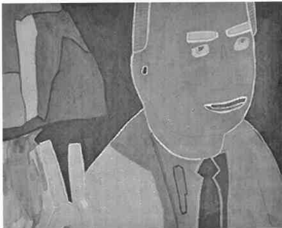
Anthony Romagnano Gough Whitlam 2014 prisma colour pencil on paper 28.5 x 35cm