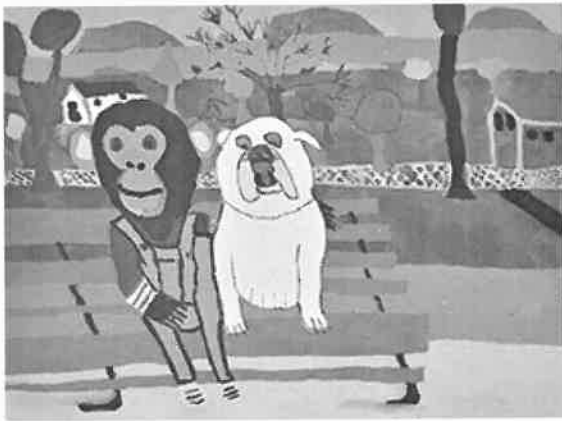
Matthew Gove The odd couple 2015 gouache on paper 28.5 x 38cm