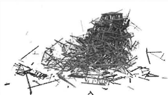
Simon Finn Steady State Expiration 2015 charcoal on paper 120 x 70 cm