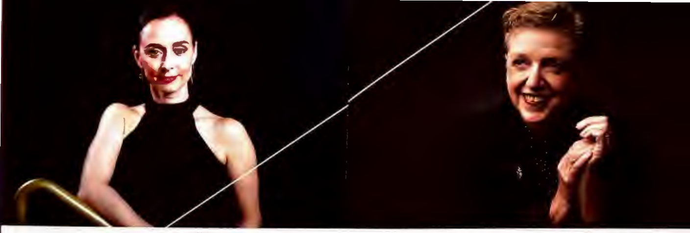
Australia Council