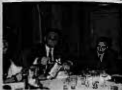
Treasury Casino Staff role-play as a person experiencing a visual disability

Term 1 will begin on 21st March and will include: Drama; Music/Dance (combined); Multi-Arts; and Visual Arts. Term 1 will end on 2nd May. Term 2 will begin on 23rd May and will finish on 4th July. Term 3 will begin on 5th September and will finish on 17 October.