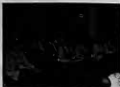
Treasury Casino Staff at the Pilot Training Program