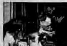
The Jones family keep busy with sales