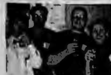
The hardworking fair staff enjoy a break