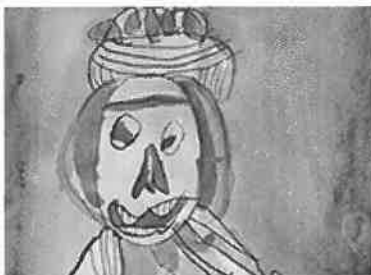
BSG Small Works Prize 16