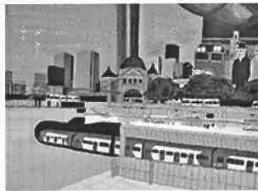
A History of the Future: Imagining Melbourne