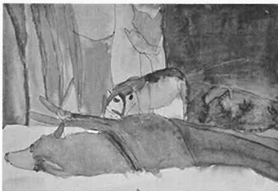
Bronwyn Hack Not titled 2014 ballpoint pen and ink on paper 27 x 39.5 cm