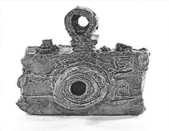
Alan Constable Green SLR 2011 ceramic 17 x 21 x 12cm

A selection of Alan Constable ceramics are currently on display at the Kunsthall Rotterdam, the Netherlands presented by The Museum of Everything .