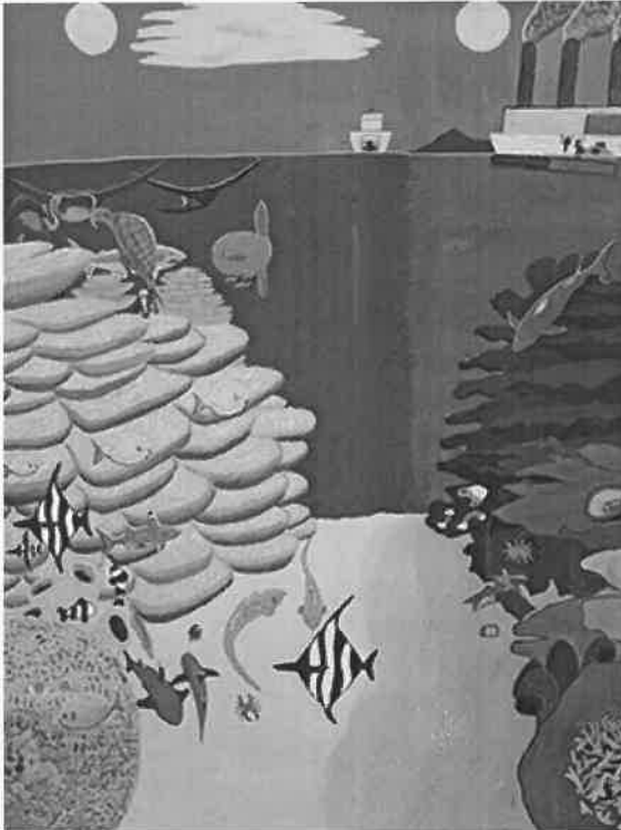
Miles Howard-Wilks The Good & Bad of the Reef 2016 work on paper 67 x 50 cm