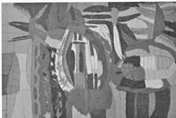
George Aristovoulou The boat on the water with the trees 2013 oil pastel on paper 38 x 56 cm

We are currently planning an expansive exhibition program outside of Arts Project gallery. Despite Melbourne Art Fair 2016 no longer going ahead, the winter months of July and August will bring wonderful opportunities for Arts Project Australia.