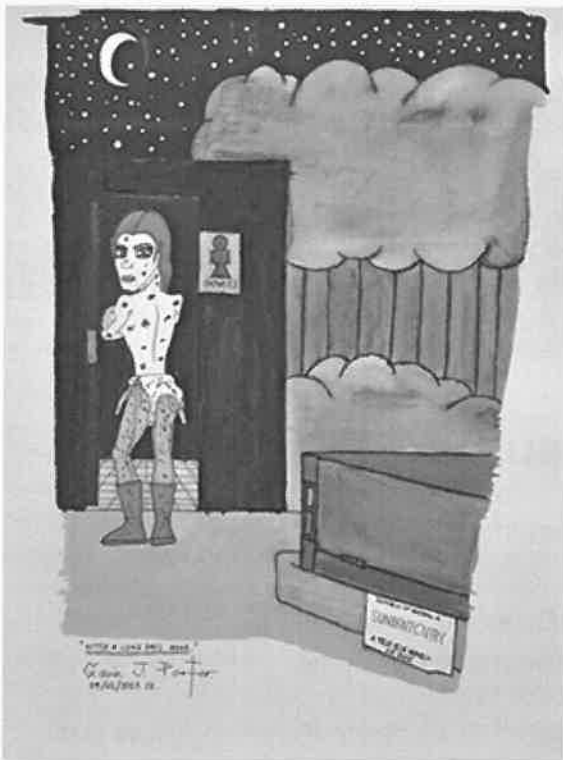
Gavin Porter After a long days work 2015 fine liner, marker and watercolour on paper 38 x 28cm