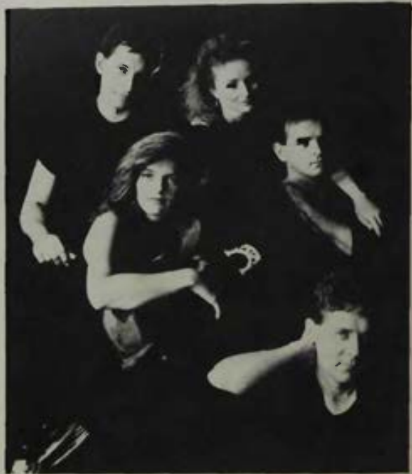
The Seymour Group one of Australia's most innovative contemporary music ensembles.

During 1987-88 the Board extended its commitment to the Australian Music Centre with a view to