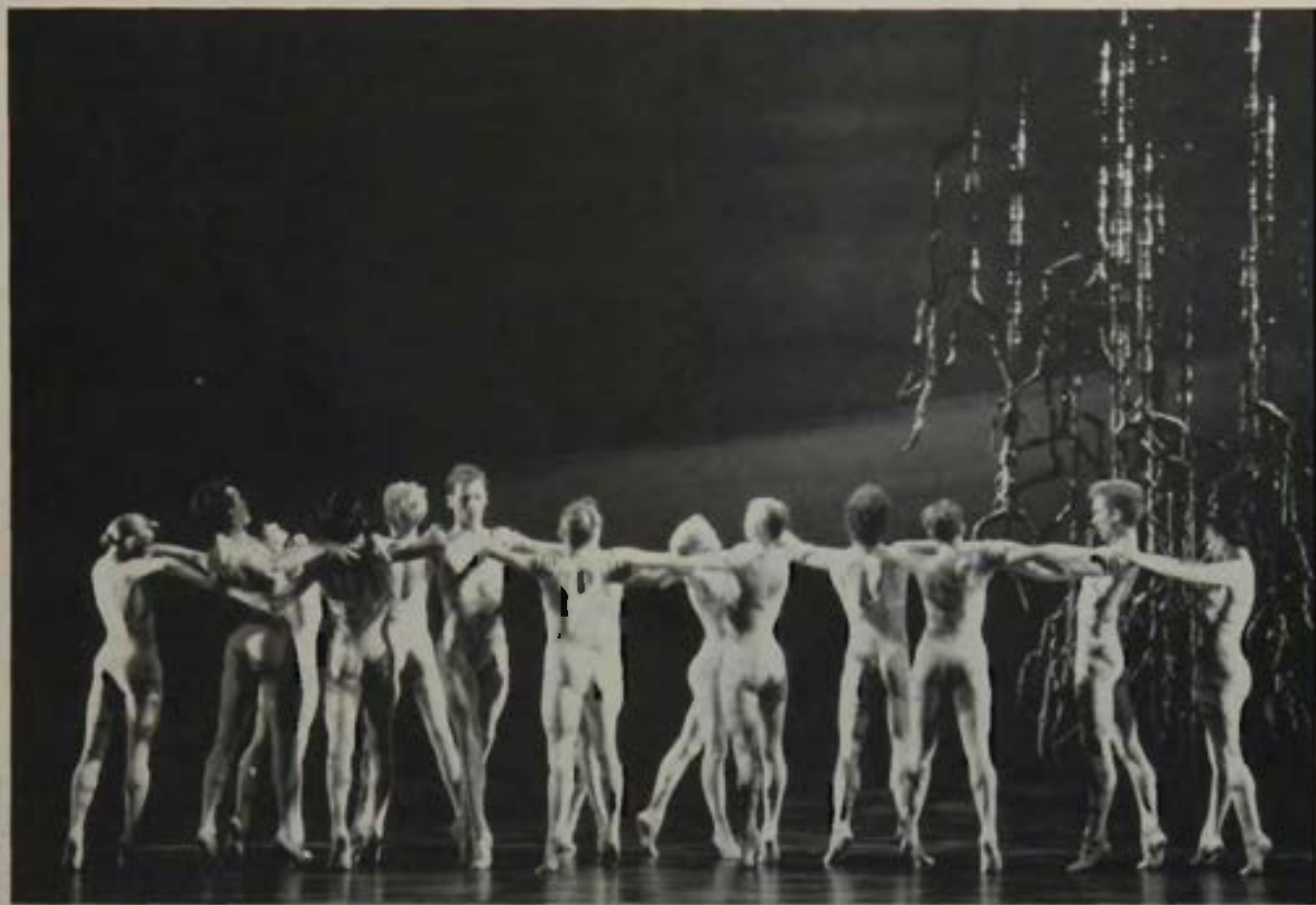
Vast the national Bicentennial Dance Event, performed by the Australian Dance Theatre, Queensland Ballet, Sydney Dance Company and the West Australian Ballet, raised the profile of dance to a new level and set box-office records during its tour around Australia.

This restructuring has produced a more cohesive Council. With four Boards instead of eight, and with the Chair of the Council also acting as Chair of the Community Cultural Development Unit and with the Design Committee as a direct Committee of Council, it has been possible to include all the Chairs of the Boards as Council members. With this integration there has also been a greater flexibility of decision-making within the areas of the performing arts and the plastic arts, and a greater concentration in these Boards on policy-making. Concomitantly, a strengthening of a system of peer-group committees has increased specialisation where it is most needed — in the making of grants-making decisions, acting within general Board and Council guidelines. The establishment of the Community Cultural Development Unit, with its inter-relations with both Boards and Council has been another integrative device.