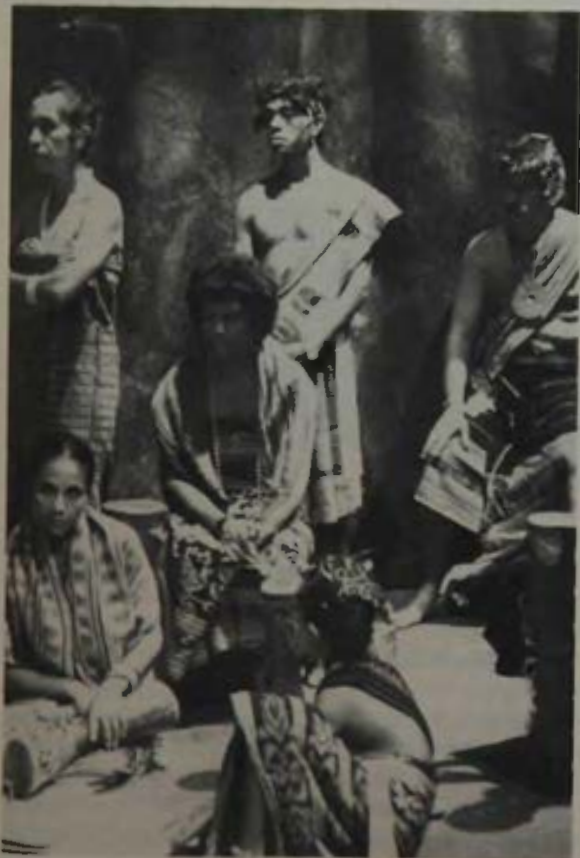
Death at Balibo a tri-lingual play about the deaths of Australian journalists in Timor involved the East Timorese La Faek Cultural Association, the Darwin Theatre Group, Browns Mart and the Migrant Resource Centre of the Northern Territory.

The Art and Working Life program has begun to attract international interest and recognition. Organisations expressing a desire to exchange information and artists include the Queen Elizabeth II Arts Council of New Zealand, the Gulbenkian Foundation in the United Kingdom, Ontario Arts Council, and various trade union organisations in England, Scotland and Canada.