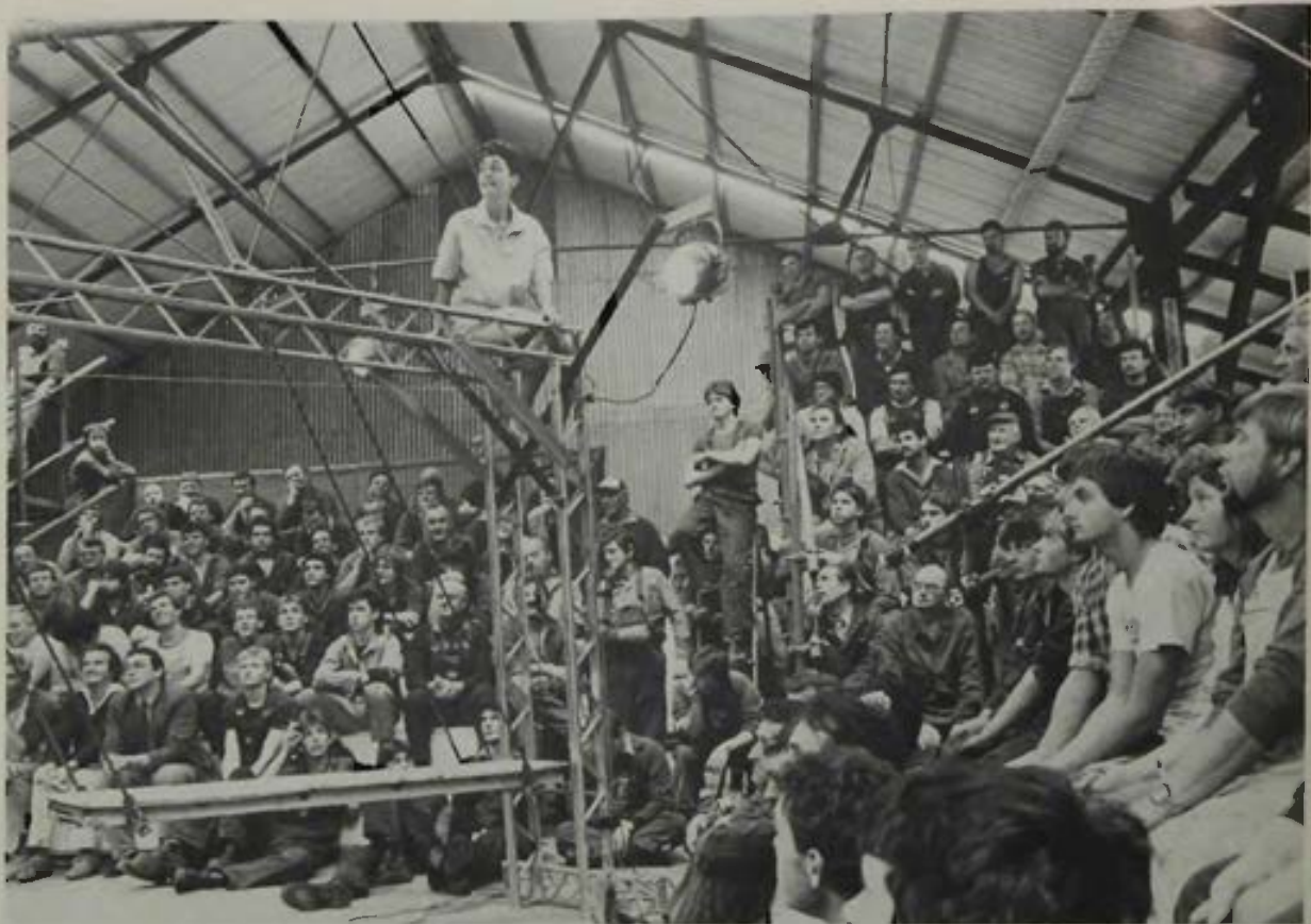
Shunters , a play about working in the railways, during a performance by the Junction Community Theatre Company in Adelaide.

In order to avoid any dislocation to existing grant programs, the Board determined to adopt for 1987-88 the budget priorities established by the two previous Boards. Overall artform allocations were thus set as follows: