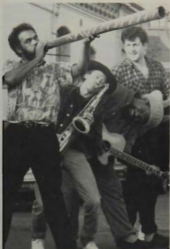
See News Editorial

Each Board is supported by a staff which includes a director, program officers and administrative staff.