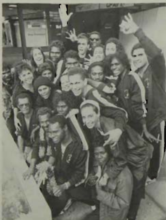
The Aboriginal Islander Dance Theatre leaving on their first international tour which proved a popular and critical success.

The Aboriginal Arts Board supports both the traditional culture of the Aboriginal and Torres Strait Island people and the many activities giving expression to their contemporary experience. The Board also promotes cultural exchange with the wider Australian community as well as abroad where interest in Aboriginal culture has grown considerably in recent years. In all circumstances, the Board aims to ensure that Aboriginal and Islander people control the development of their own forms of expression.