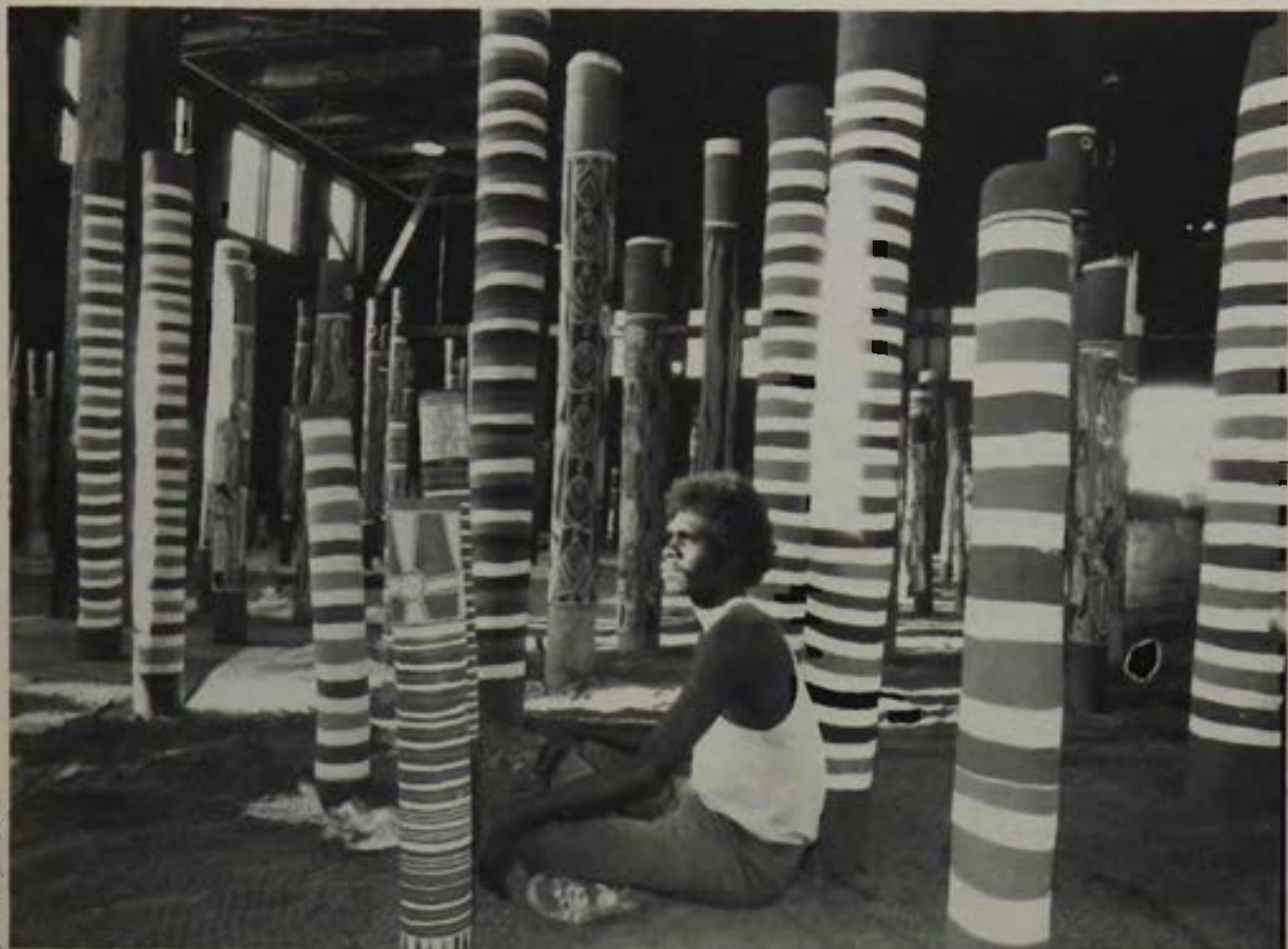
A dramatic collection of 200 Aboriginal burial poles was transported by barges, aircraft and trucks over 4000 kilometres to Sydney for the 1988 Australian Biennale before being permanently installed at the Australian National Gallery in Canberra.

nal Co-operative in Perth offers advice and resources to Western Australia Aboriginal artists both in traditional arts and in contemporary practice.