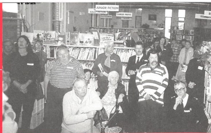
Queenscliff Arts Access Experience