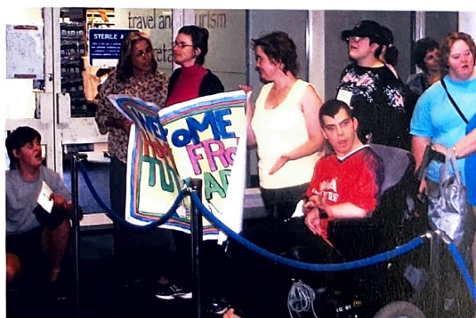
Welcome home from Tutti Arts

As part of their research a combined Tutti Arts / Interact group spent four days at a wilderness lodge on Bearskin Lake in northern Minnesota near the Canadian border. Here they were introduced to the history and survival techniques of the Inuit and Sioux Indians as well as the French Voyageurs. They learned about and experienced snow shoeing, dog sledding and cross-country skiing. A second weekend was spent visiting an Ojibway Indian Reservation and radio station in Wisconsin. On that trip they also participated in an inter-tribal Pow-wow at Circle of Pines, and learned about ice fishing at Bass Lake.