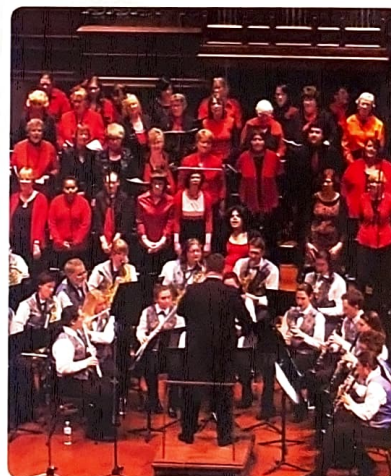
Tutti Choir and The Unley Concert Band at Broadway Spectacular, Elder Hall, July 2010