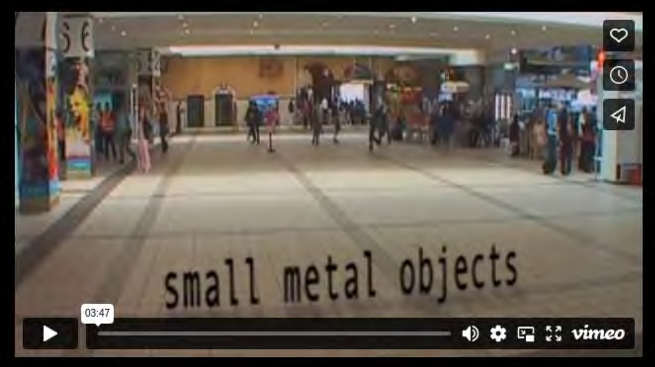
Click to view trailer