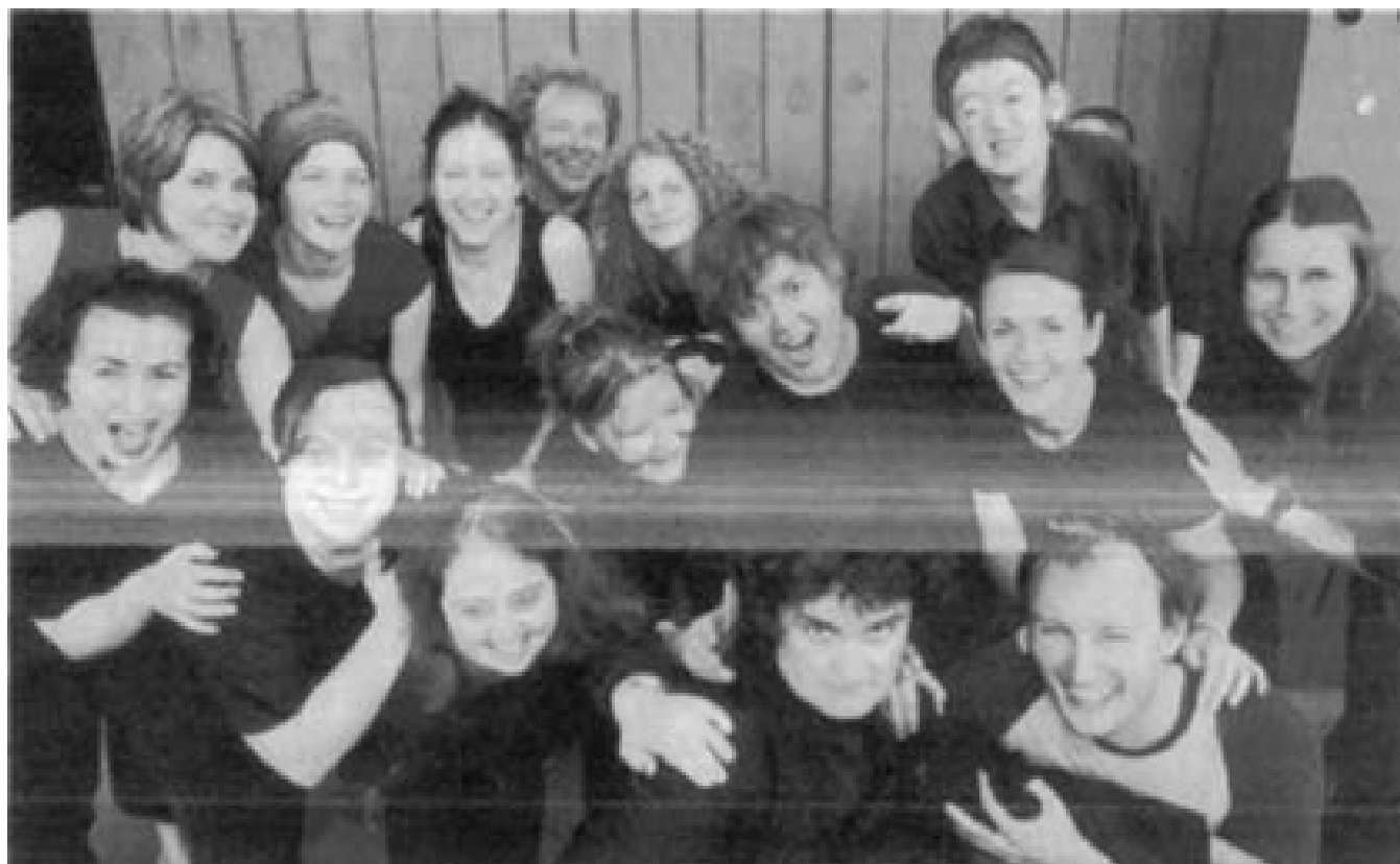
The 2001 Accessible Arts IPP 'Dream' performers.