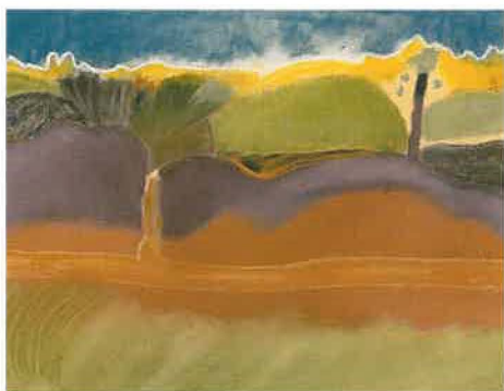
"Landscape" 1994 Artist: Jimmy Fuller

Our focus for the future is on ensuring continued support, encouragement and opportunities for people with disabilities to achieve recognition and participation in the visual arts and the cultural life of the community.