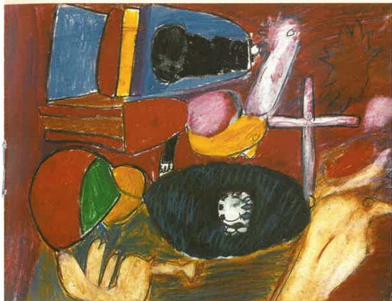
Above: "An Aboriginal Lady in a Spaceship and our Lord and Bird Eating a Fish." 1991 Artist: Dorothy Berry

The successes of the Studio Workshop program lie not only in the artistic development of the individuals, but also in the more intangible realms of their personal growth, increased confidence in their abilities and the opportunity to develop their capacity for self-expression.