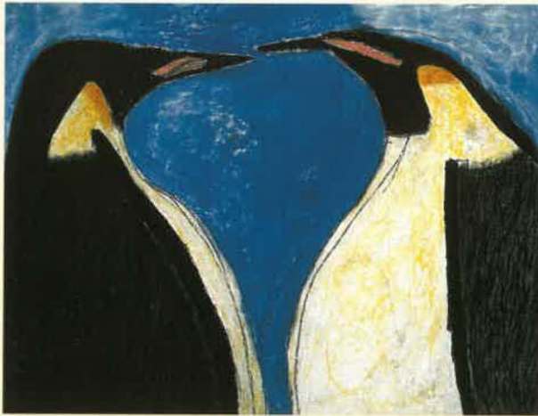
(Untitled-Penguins) 1994 Artist: Alan Constable