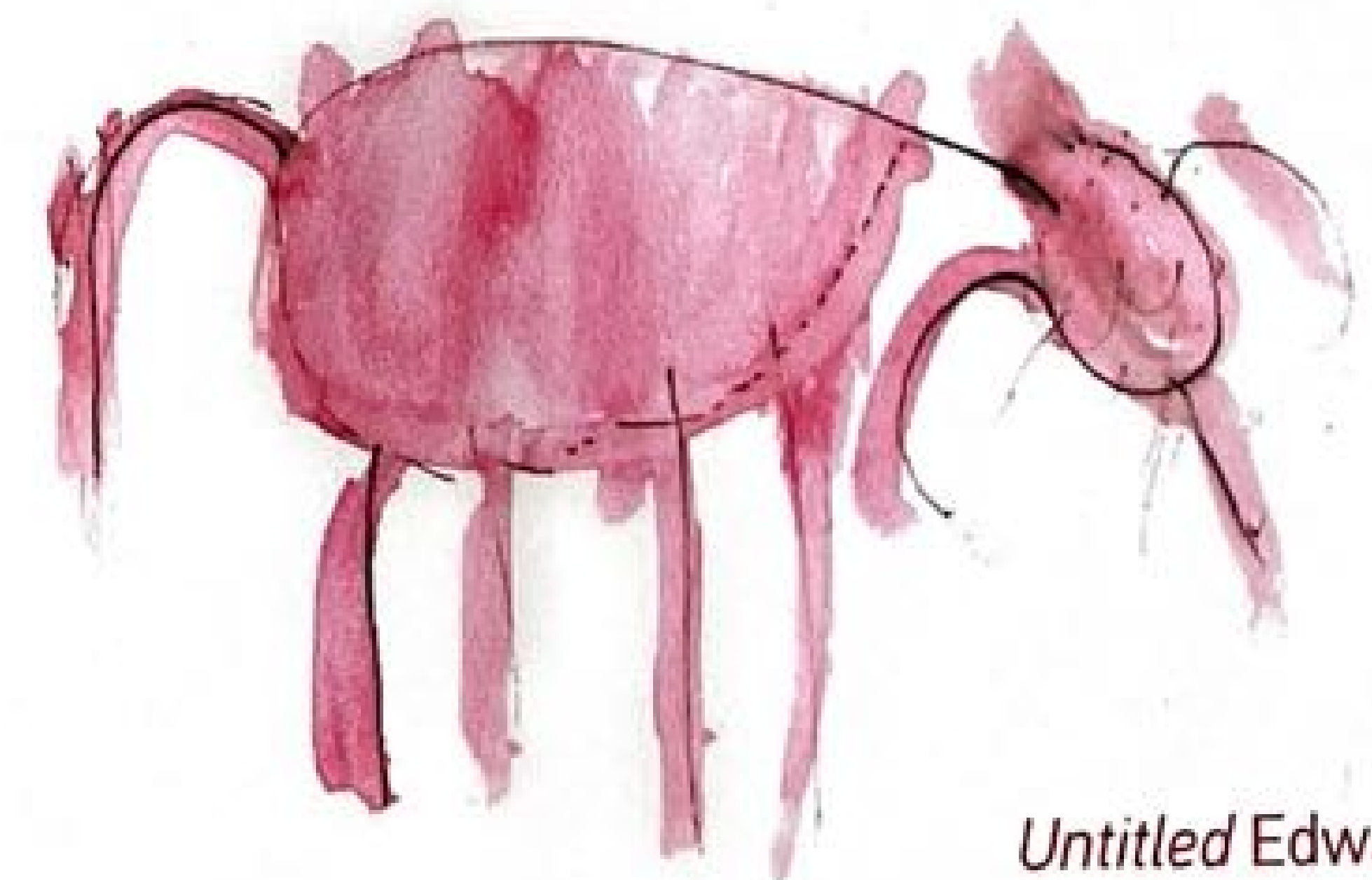
Untitled Edward Treloar