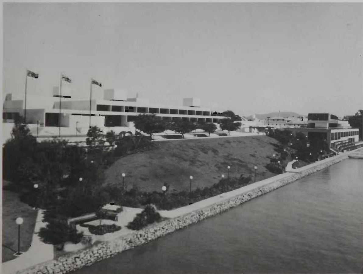
The opening of the new Queensland Art Gallery in June provided a permanent home for the state's art collection.