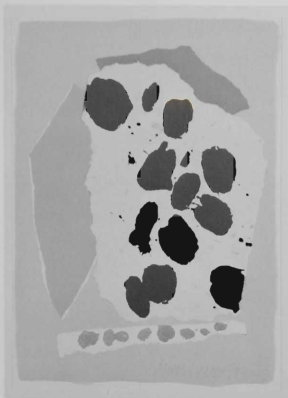
Another exhibition from the Board's Regional Development Program number 10 The Collage Show included a collage by Alun Leach-Jones The Sepik Suite Sepik River 2 .