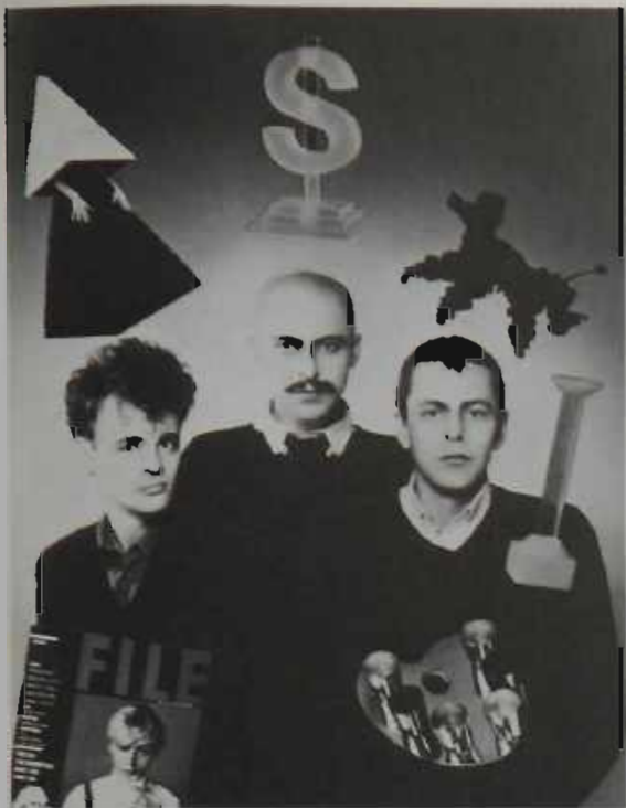
Among the overseas participants in the Fourth Biennale of Sydney were the Canadian artists General Idea.