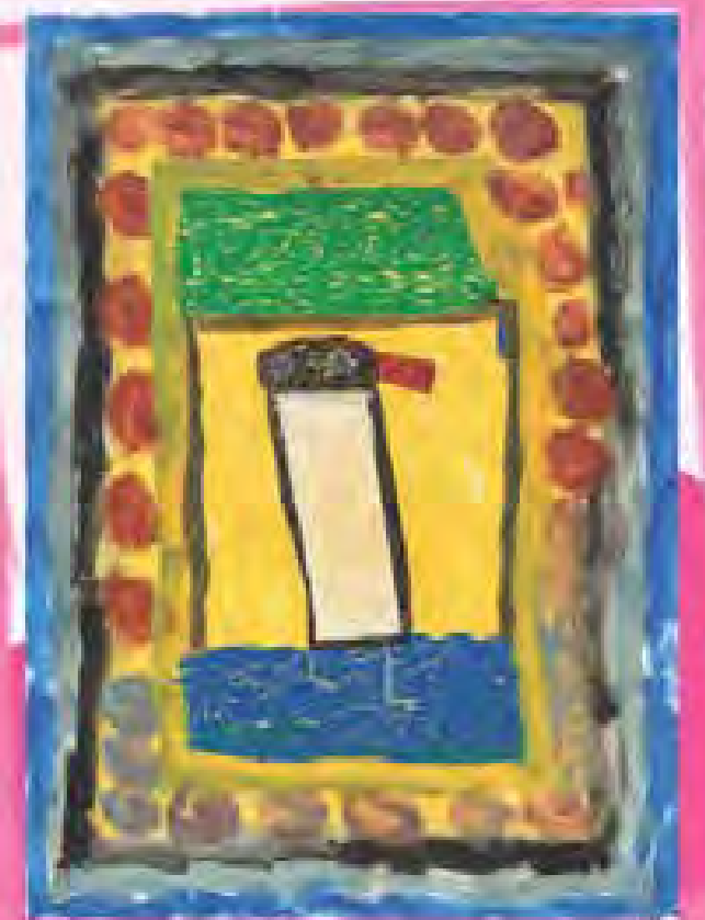
Ellese McLindin, Penguin at Seaworld acrylic and posca pen on paper 70x50cm