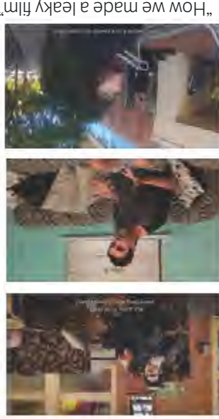
"How we made a leaky film"