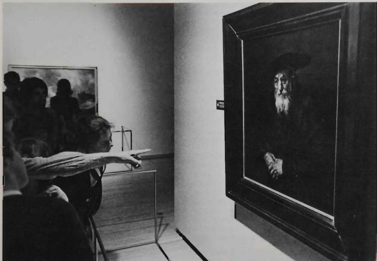
Gallery visitors with Rembrandt's Portrait of an Old Man , from the 'USSR: Old Master Paintings' exhibition