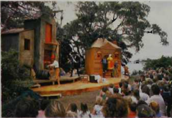
Nimrod's production of Pirates at the Barn staged on Clark Island as part of the Sydney Festival

Three 'limited life' grants were awarded under the Theatre Board's new scheme to underwrite professional projects of an innovative or developmental nature. The purpose of the scheme is to allow professionals of demonstrated ability to explore new avenues in theatrical work and by so doing to revitalise their area of the performing arts.