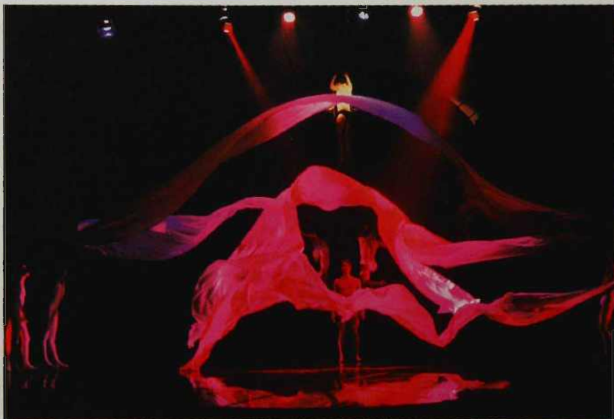
Wildstars , a major new work by the Australian Dance Theatre