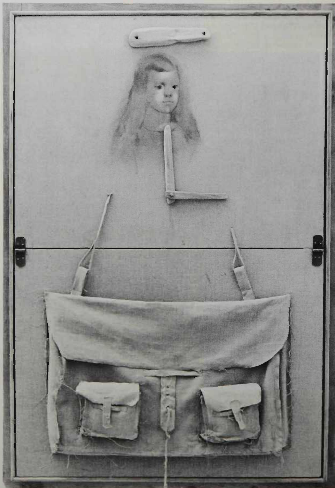
An Infanta after Velazquez, 1976 by Tadeusz Kantor Included in 'European Dialogue', 3rd Biennale of Sydney at the Art Gallery of NSW 1979