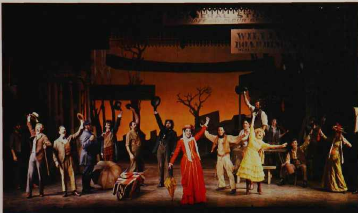
The Sunny South , inaugural production of the Sydney Theatre Company at the Drama Theatre of the Opera House

Australia's first national secretariat representing non-profit performing arts organisations in dance, drama, puppetry, youth theatre, mime and orchestras. The Confederation of Australian Professional Performing Arts was formed following meetings of interested groups throughout Australia. It aims to store and disseminate information relating to the resources and development of all constituent performing arts companies; to promote the sharing of goods, services and expertise of members; and to help safeguard the financial basis of the non-commercial, professional performing arts.