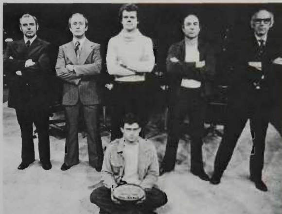
The cast of the Nimrod Theatre's production of David Williamson's The Club

A visit to the US by an Australian company of