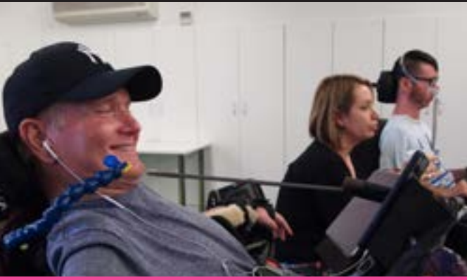
The Committee screenwriting project by Torrid Films; Quick Response Grant recipient.