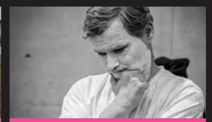
'Out of Line' Shopfront Bodylines Ensemble at the arts + disability expo.