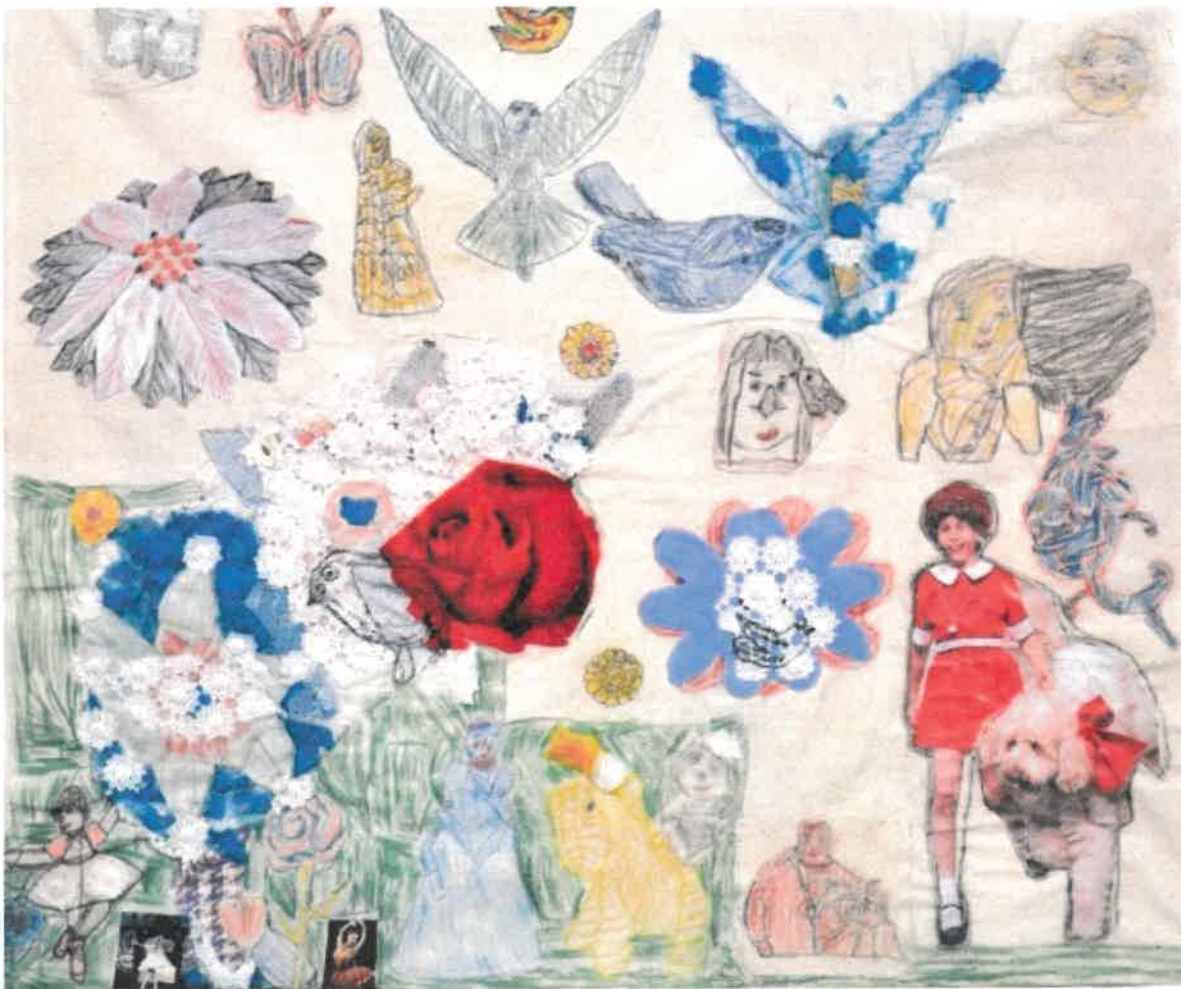
BRIGID HANRAHAN, NOT TITLED , 2012, WORK ON CANVAS, 62 X 74CM.