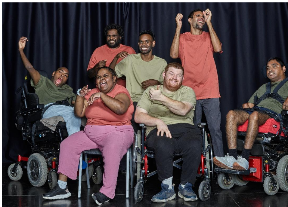
stArts with D Artists

stArts with D (SWD) continued the creative development of Strong Feelings, after much interruption and directional change brought on by the impact of COVID. The program found its feet with the creation of unique disability-led creative works, due to be presented in a multi-arts exhibition scheduled for March 2023.