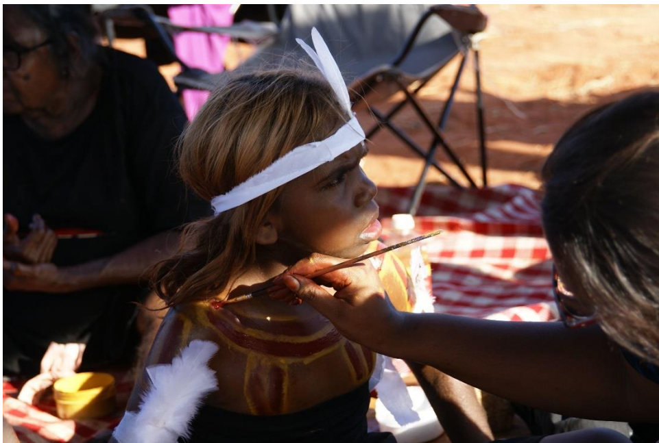
Young Warlpiri girl involved in 'paint up' with singing and preparation for cultural dancing

Incite has taken on the role of Lead Organisation for the program 2023-24 and secured 2-year funding to enable this to happen. This exciting development ensures the strong relationship endure between Incite Arts and the Warlpiri community, which benefits new generations of girls and women to engage in the cultural camps and learn and grow together.