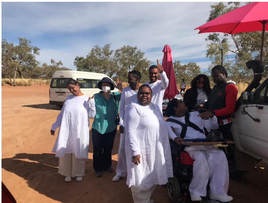
stArts with D Artists and support team on location for filming of Strong Feelings

Through engaging communities in performing arts activities, we create extraordinary opportunities that transform the lives of those involved through collaborative, innovative, and creative experiences.