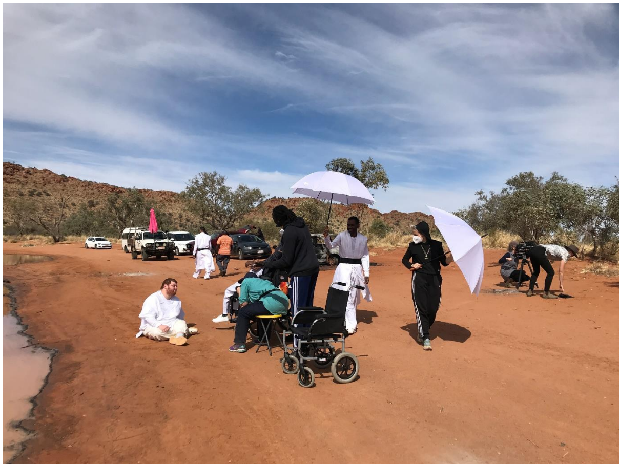
stArts with D Artists and crew on location for filming Strong Feelings