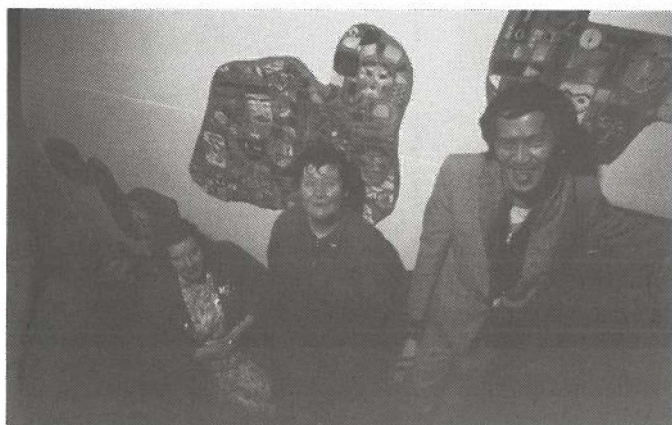
Left: Participants in the Prahran Health Centre project with art works installed in the stair well of the Centre foyer.