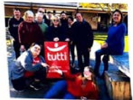
Some of the Tutti Arts Barossa artists