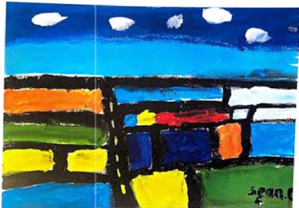
Tutti Artist Sean Cooper Title - Cityscape

Medium: Acrylic on Canvas Size 25 cm x 20 cm $55.00