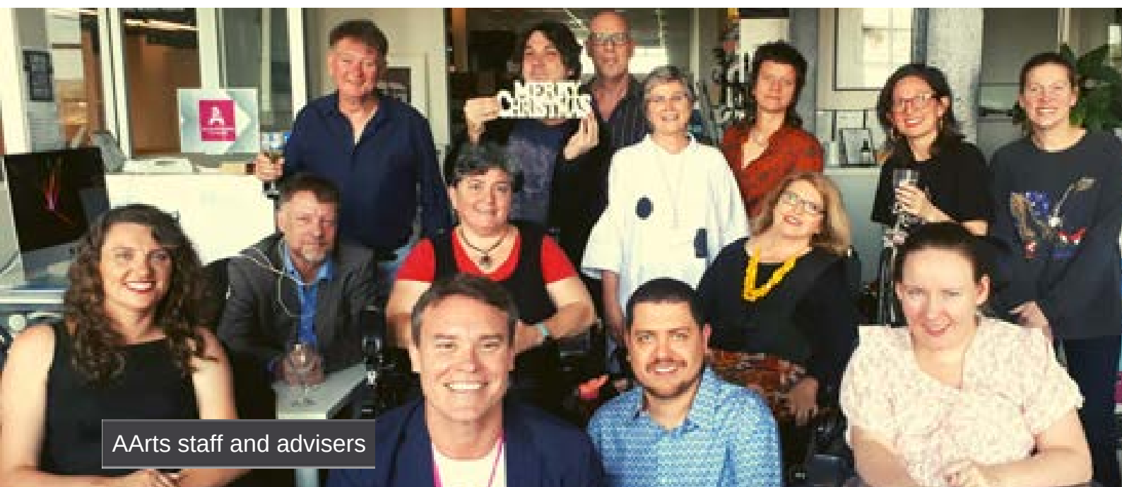
AAarts staff and advisers