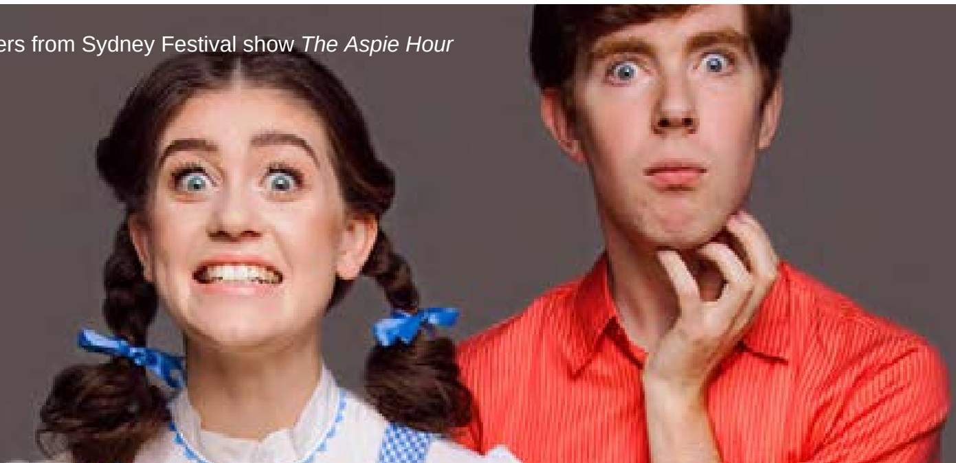
Performers from Sydney Festival show The Aspie Hour

forum for building connections and collaboration among artists with disability. In addition, our team delivered assistance and advice to individuals and groups with funding applications as well as identifying opportunities for showcasing their work.