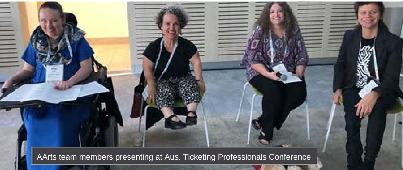
AAarts team members presenting at Aus. Ticketing Professionals Conference

A highlight of this work involved evaluating the Eastern Riverina Arts