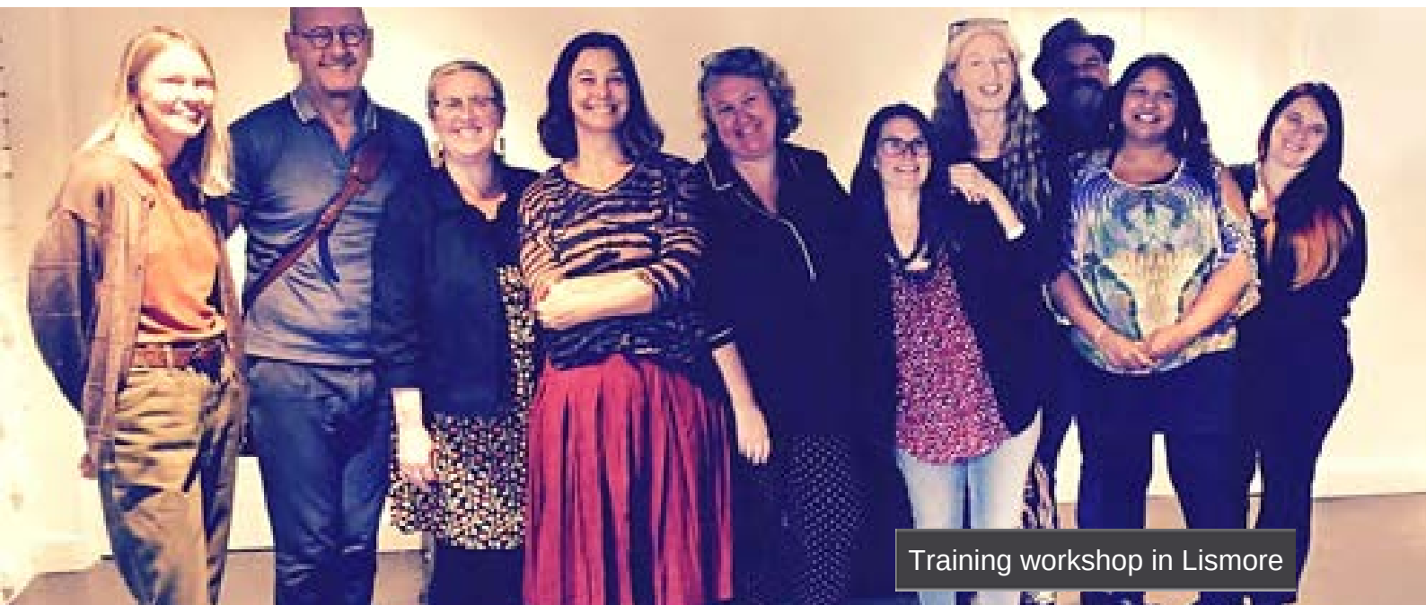
Training workshop in Lismore

"Keep prioritising disability led practice, leadership and collaboration. Along with disability-led, make space for integrated initiatives as well, and the nurturing of informed connected allies."