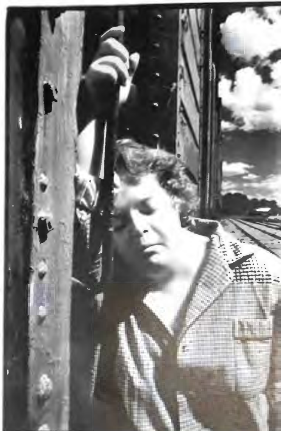
THE DAYS ALLOTTED TO ME

Time/s: Fri 28th 2.30pm, Wed 3rd 12.30pm, Sat 6th 10am Duration: 1 1/2 hours Venue: Banquet & Lyric Room, Adelaide Festival Centre Cost: $10, $8 conc. Bookings: BASS 131 246