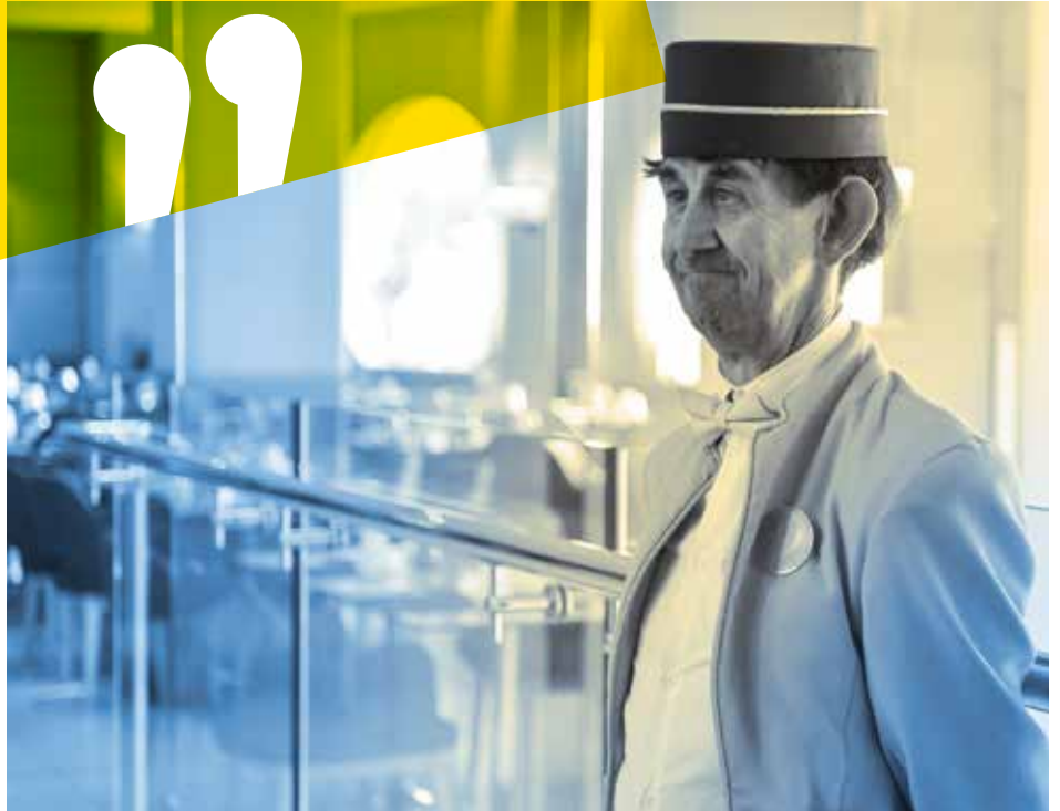
Intimate Space