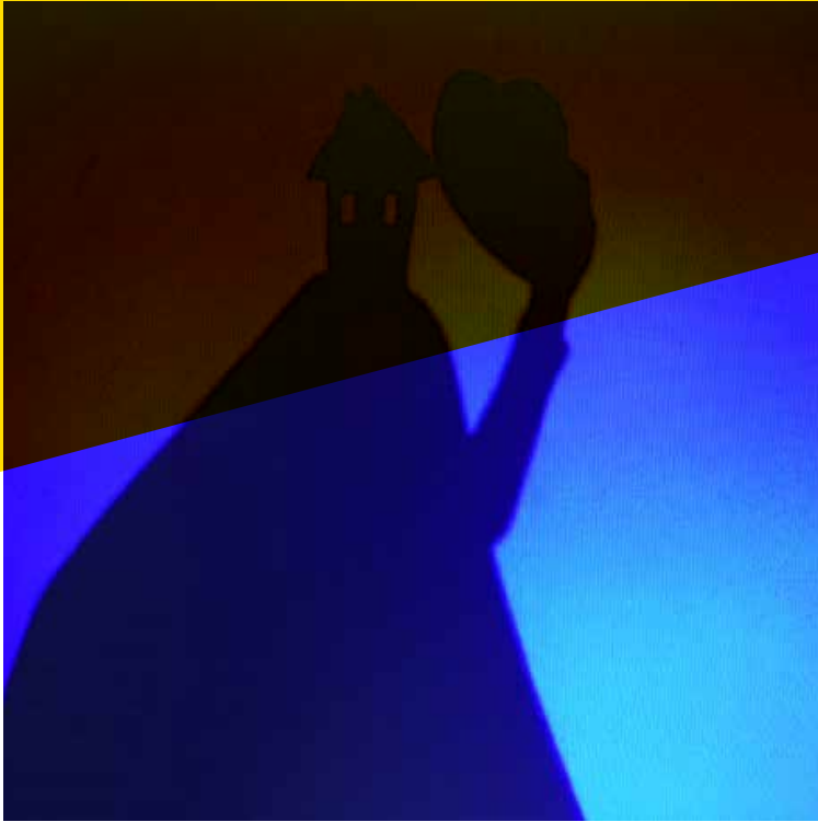
Zizanie

From the reprise of the critically acclaimed Intimate Space on the Gold Coast, to performing at the Commonwealth Games Closing Ceremony televised to an audience of an estimated one billion globally (and over one million in Australia), and the development of new work Zizanie with world-renowned Meryl Tankard, 2018 has been another hugely successful year for Restless.