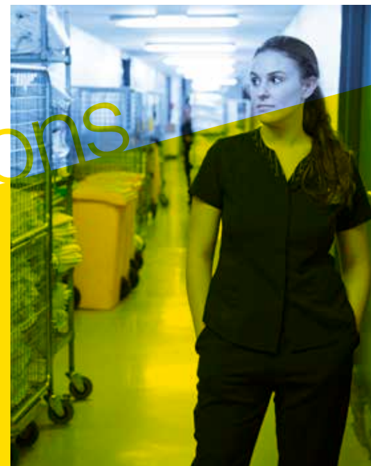
Intimate Space

Intimate Space on the Gold Coast was also nominated for the Made In Adelaide Ruby Award.