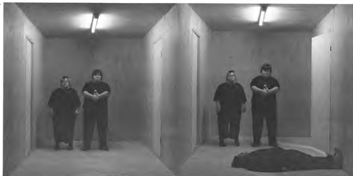
THE DEMOCRATIC SET

PROJECT PARTNERS: Windarrang, based in Central Victoria, ensures that people with disabilities have choice of, and access to quality services. CreateAbility Events Network, based in Bendigo, provides opportunities through the arts for people of all abilities.